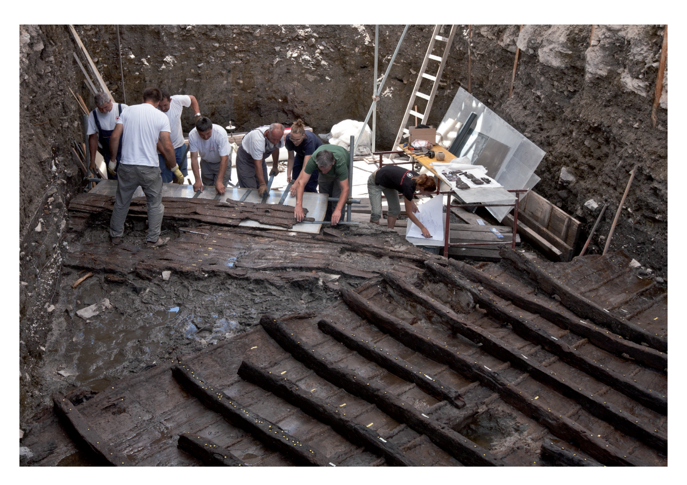
Figure 4. Recovery of Pula 2. In the foreground Pula 1.

After being stored in a tank of fresh water, Pula 1 and 2 were sent to the ARC-Nucléart laboratory for conservation by PEG/freeze drying. It is important to underline that, due to the dimensions of the freeze drier, Pula 1 had to be dismantled into two major parts not larger than 3 m. Currently, both the treated shipwrecks are stored in boxes awaiting future display in Pula.