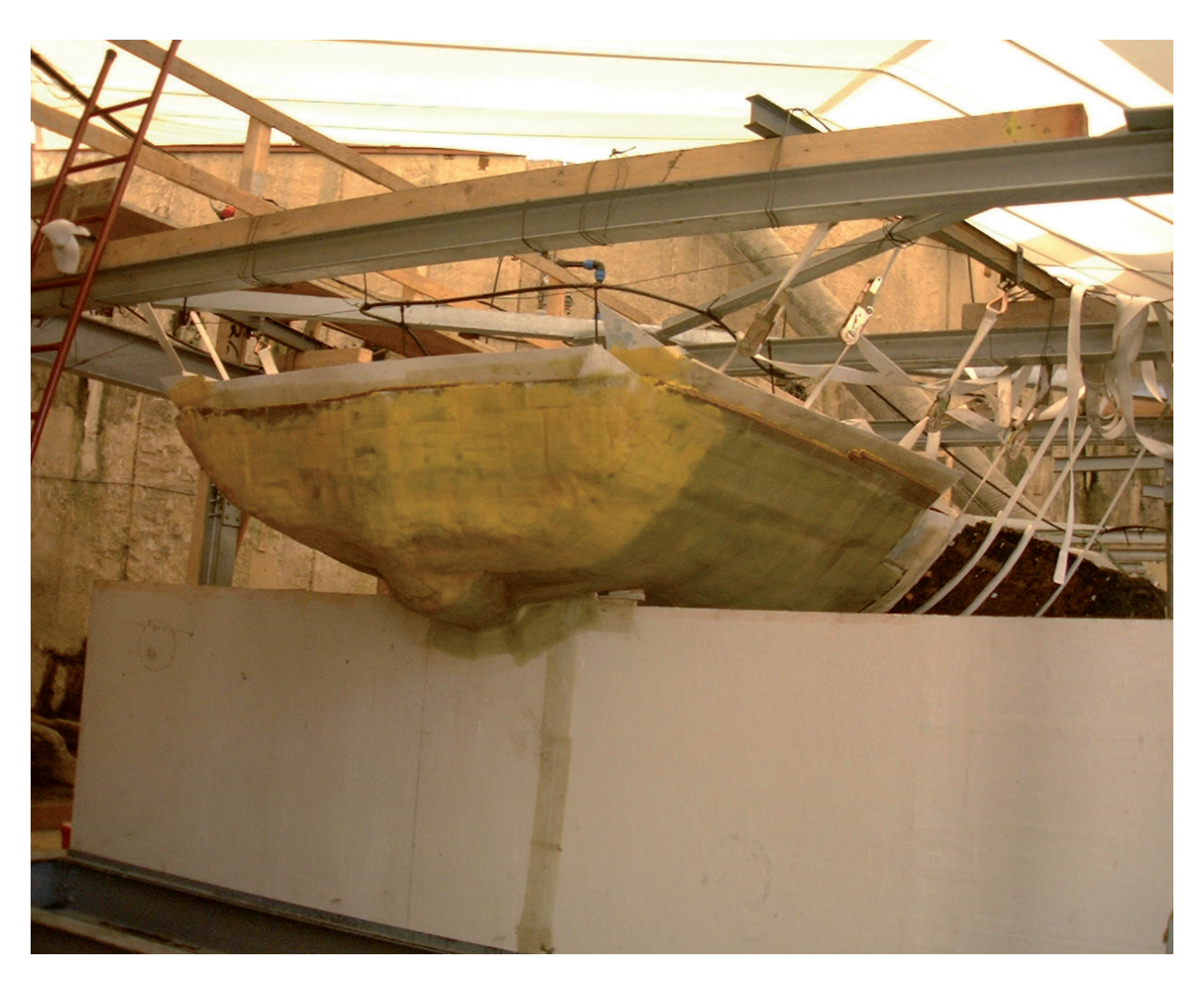
Figure 3. The fiberglass shell under construction on the prow of Napoli C shipwreck.