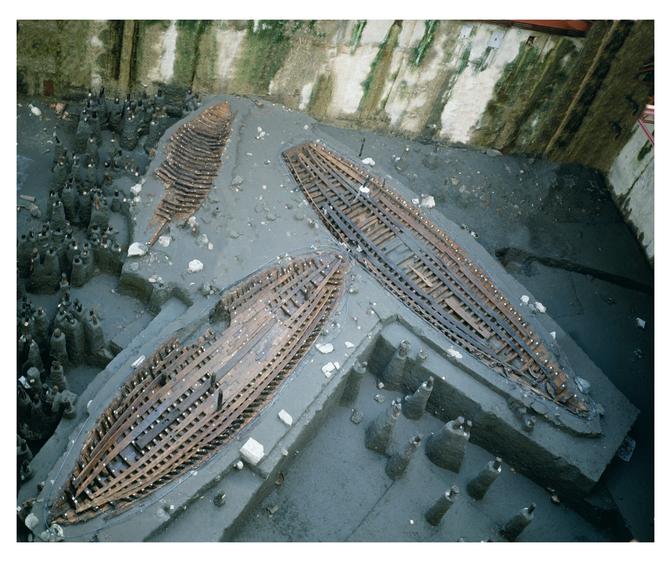
Figure 2. The shipwrecks Napoli A, B and C.

shells. The idea was to use this structure also during the conservation treatment: the PEG would circulate in the space between the double fibreglass shells to impregnate the wood.