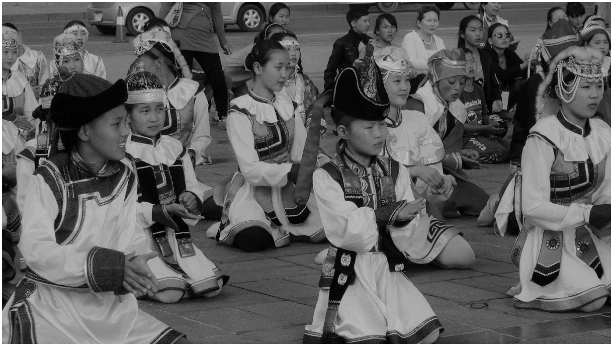
Figure 2 Mass transmission is perceived as generating potential risk of distortion of an authentic practice.

The definition of an element of cultural heritage as opposed to cultural evolution is not only coherent with the UNESCO project of Cultural Intangible Heritage. It is also quite striking in the vocabulary employed by all actors – those in charge of heritage policies, biich , professional dancers and choreographers – in Mongolia, to describe bii biyelgee as opposed to staged Mongolian dance.