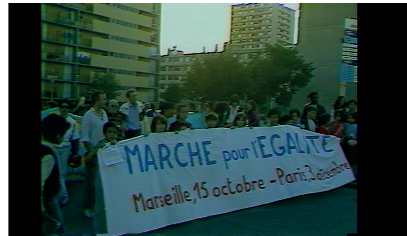
“Retrospective on the March Against Racism leaving from Marseille and arriving in Paris”, Broadcast Archive, FR3, Ina, 1983-12-03. Id: RAC240-0448

Based on a corpus composed of data obtained from the web archive of the INA, which includes web pages referencing the history of the 1983 March for Equality and Against Racism, we explored how this postcolonial event was portrayed online, improving computational methods for text analysis. The study of large corpora of historical data from archived web sources is grounded in a corpus co-constructed with web archivists and focused on the year of the March's thirtieth anniversary in 2013. Semantic network analysis underscores the different interpretations of this historical event.