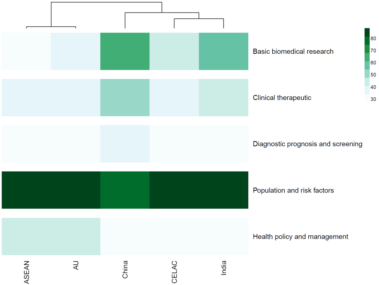
Figure 3. Heat map and cluster analysis of the profiles of countries and regions of the global south by levels of gerontological, geriatric and aging research.

An analysis of the distribution of coded terms by research levels allows us to understand more clearly from what approaches do countries and regions of the global south address the issue of aging. The clustered heat map in Figure 3 summarizes the results of this analysis. The heat map shows that the population and risk factor concepts are common to the vast majority of publications from all the regions analyzed, which is consistent with the central cluster of terms that were observed in the co-occurrence network of terms (compare figures 2 and 3). The heat map clusters the different funding channels based on the distribution of the terms coded at the levels of research. On the right side a group formed by the AU and ASEAN prioritizes research on aging at the level of management and health policies over a biomedical approach while in the second group, on the left, formed by China, India and CELAC shows the reverse pattern (figure 3). Research on aging in China is distinguished from the other cases studied by having the highest percentage of publications with terms associated with the basic biomedical, clinical-therapeutic and diagnostic levels, and the lowest percentage of publications at the management and health policy (Figure 3).