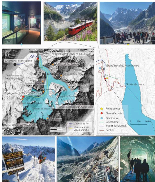
Figure 1. Location map of the Mer de Glace and Montenvers basins

The extension of the Mer de Glace comes from the 2013 GLIMS inventory.