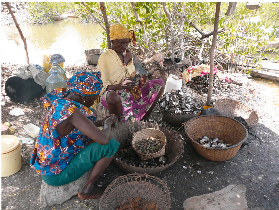
Photo 1. a oysters' yard in Tendouk territory, Casamance, Senegal.

urbanization, schooling, etc.). (Cormier-Salem, 1985, 1987, 1992, 1994). The multiple use system of the mangrove allowed Joola fisher-farmers to adapt to this crisis, notably reorganize their farming calendar and reorganize the use of their territories.