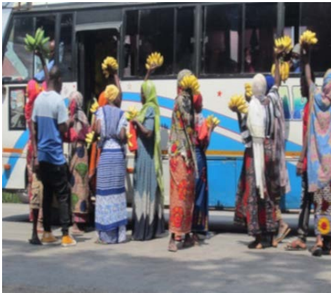
Photo 1: Women selling bananas along the main road to and from Dar es Salaam to the southern parts of the country, in Mohoro East and Mohoro West, 2021