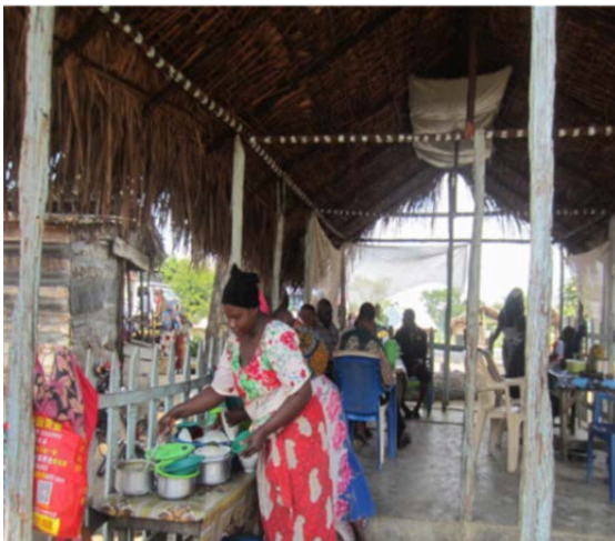
Photo 2: A female-run food vending store, in Mohoro East and Mohoro West, 2021