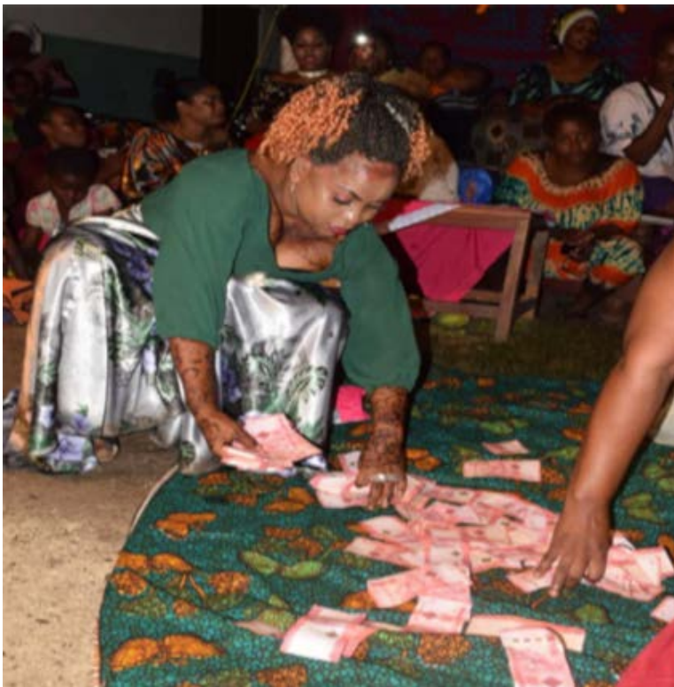
Photo 3: A kitchen party host collecting money from her group, in Mohoro East and Mohoro West, 2021

The evolution of this cultural custom echoes Gluckman's (1954) analysis of how the reinvention of ritual activities can be geared to social transformation. Gluckman thus illuminates the dual conservative and transformative nature of rituals. Borrowing from Onyebueke & Ikejiofor (2017), I argue that the reinvention of the Kinyamu dance rite of passage, renewing the social meaning of the kitchen party ceremonies, is evidence of the transformative nature of ritual in enabling women to access land through purchase in Mohoro East and West villages.