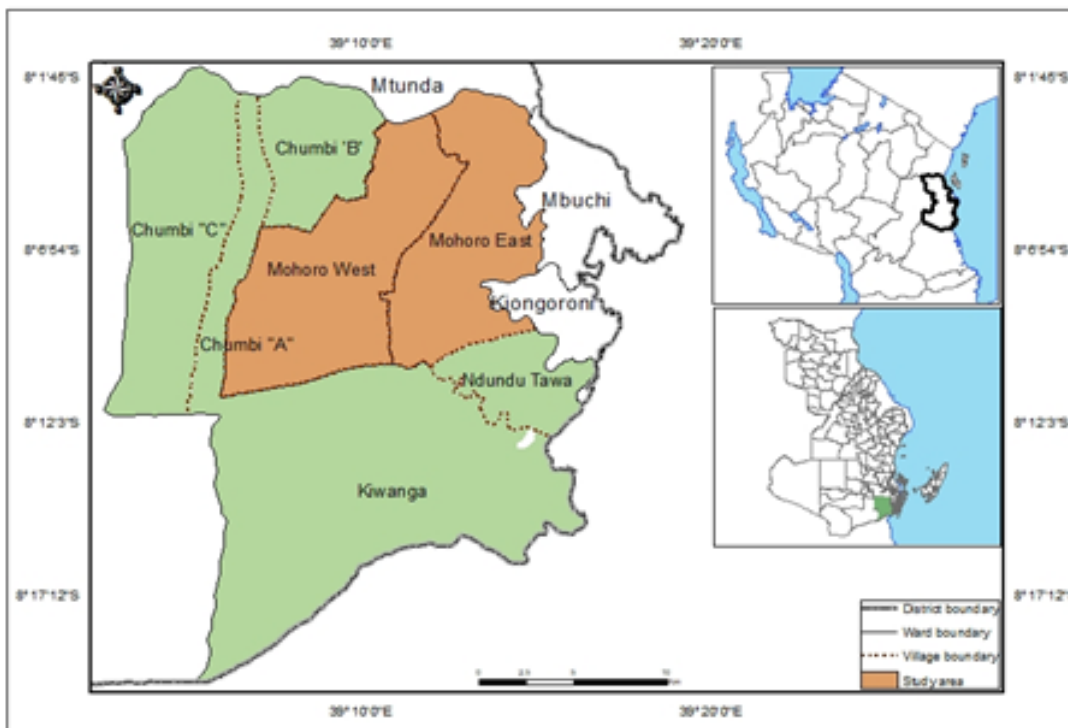
Figure 1: Study Area—Mohoro East and Mohoro West villages

Founded in 1967 during the first stage of implementation of the Ujamaa Policy (literally meaning the “village of Ujamaa ”: see Figure 1), Mohoro East and West villages were merged and known as Mohoro Ujamaa Village with registration number 1975 PW/KIJ/209 (Massay, 2017). Presently, the two villages are administered under a governmental infrastructure comprising several institutions such as the village council, the land council, the village assembly, the market place, and two land use plans (of 2008 and 2011) (Ibid.). Mohoro West consists of six hamlets: Old Mohoro, Sungapwani, Sungabara, Nyandote, Nyakikai, and Mwanani, while Mohoro East is composed of five hamlets: Nyampaku Bara, Nyampaku Pwani, Nyampaku Mashariki, Nyamidege, and Nyautika.