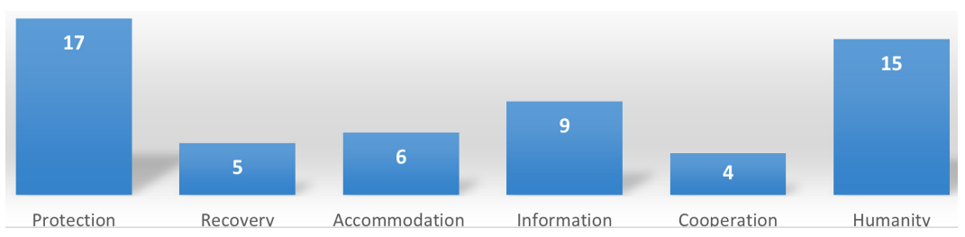
Figure 3. Number of CIs per category/theme (total CIs=56)