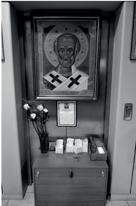
Figure 4. At Anadyr airport (2018).

During my fieldwork in 2018, the Orthodox Church was also establishing its presence in other sectors of public life. Members of the Orthodox clergy regularly visited hospitals, schools, government offices, and police and fire stations in accordance with both the civil and the liturgical calendar. For instance, they took part in all work-related celebrations, remnants of the Soviet period, such as the Day of the Fire Fighters. In particular, they attended all celebrations linked to military activities, such as the Day of the Protectors of the Fatherland ( den' zashchitnika otechestva ) and the Day of Victory ( Den' Pobedy ) – May 9, commemorating the end of the Second World War in Europe. As in all of Russia, the Orthodox clergy of Chukotka lays special emphasis on everything linked to Russian patriotism. They even bless military equipment. The Orthodox Church also has a highly visible area at the airport with icons, a candelabrum, and pens and paper for those who want to write down prayers.