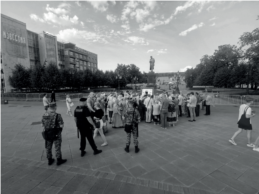
Figure 5. The stoianie during the Moscow International Film Festival (2023).

On this day, some passersby joined the prayer group. Others were interested in what was going on; they heard what was for them a new history of Moscow. Still others took photos. Members of the community answered questions and handed out the akathist to those who showed interest. They behaved in a hospitable manner, as if they were the rightful masters of the place. The degree of visibility was aptly summed up by one woman from the community: "Today everyone was supposed to shoot the artists, but they filmed us."