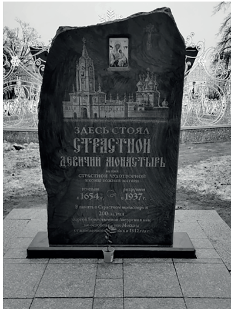
Figure 1. Commemorative stone with a small Strastnaya icon by Aida Melikhova, Pushkin square (2018).

This granite stele, with an irregular shape about half a meter high, is engraved with the image of the monastery and the following inscription: “The Strastnoy monastery in the name of the Most Holy Theotokos Strastnaya Icon stood here. It was founded in 1654 and destroyed in 1937. In the memory of the Strastnoy monastery and the 200th anniversary of the first divine liturgy in the name of the liberation of Moscow from Napoleon’s army in 1812.”