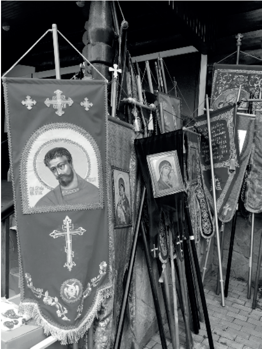
Figure 3. Church banner with Tsar as Martyr, Ekaterinburg (July 2018).