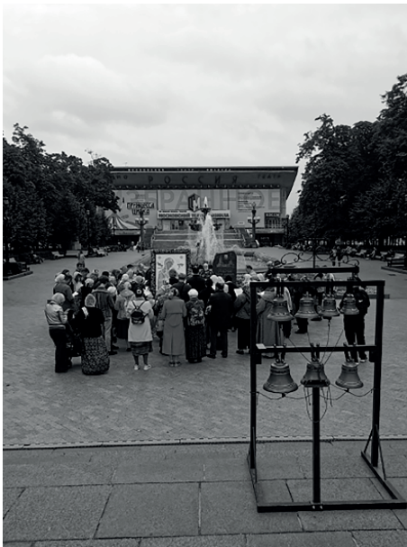
Figure 2. A prayer meeting ( stoianie ) in Pushkin square (2022).

The physical existence of preserved objects makes the imaginary monastery more tangible. As Certeau writes, “narrative activity... thus continues to develop where frontiers and relations with space abroad are concerned. Fragmented and disseminated, it is continually concerned with marking out boundaries... stories ‘go in a procession’ ahead of social practices in order to open a field for them” (CERTEAU, 1984: 125). Storytelling thus fulfills a sanctioning function in this case—the community has every right to occupy the square.