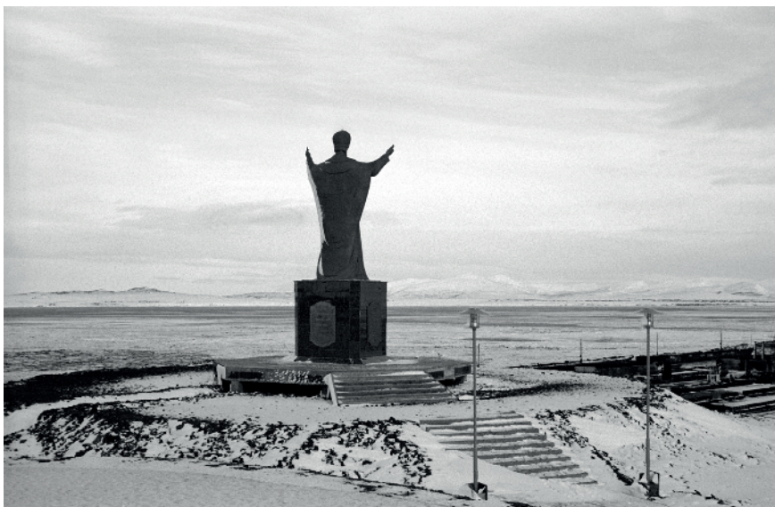
Figure 1. Statue of St. Nicholas the Miracle-Worker, Anadyr (October 2004).