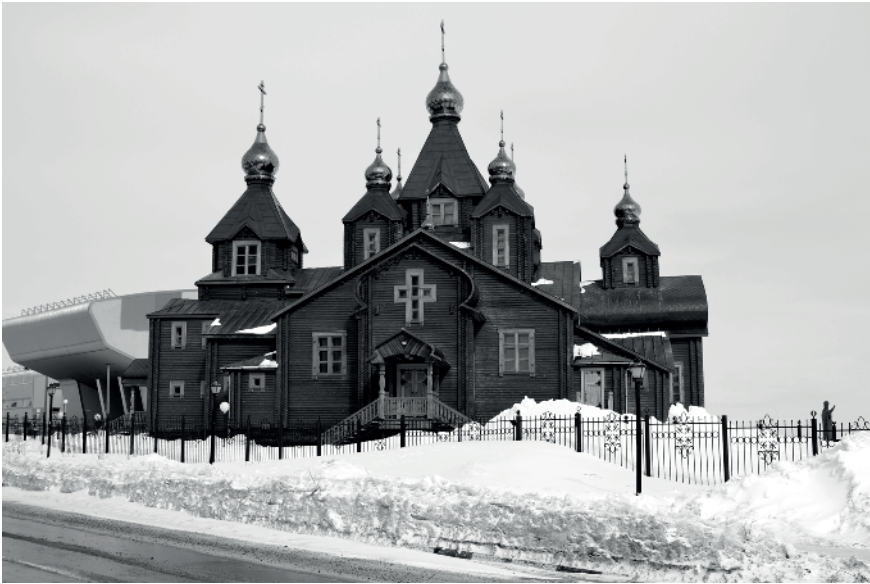
Figure 3. The Cathedral of the Holy Trinity Source of Life after its renovation, Anadyr (April 2018).

In 2018, when I was in Anadyr, a city of circa 12,000 inhabitants, the Cathedral of the Holy Trinity Source of Life held religious services daily, and sometimes twice a day. Several new developments bore witness to recent investments serving to promote the activities of the Church. In 2012, on Lenin Street, next to the cathedral, the eparchy had commissioned the construction of an administrative building, which also included a residence for the bishop and for some members of the clergy. Then, in 2017, the eparchy had launched a new website, hiring full-time a professional photographer to supply it regularly with new pictures and information. 14 Under Archbishop Matfei, the cathedral, which had been built ten years earlier, was renovated and fitted out with a high-quality lighting and sound system. The choir was composed of professional singers from mainland Russia, who were regularly shifted after fulfilling the terms of short-term contracts and benefiting from augmented salaries.