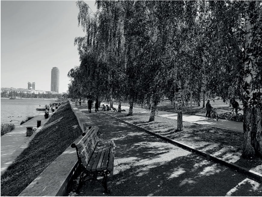
Figure 1. The park in October Square, on the banks of the city pond, Ekaterinburg (September 2019).