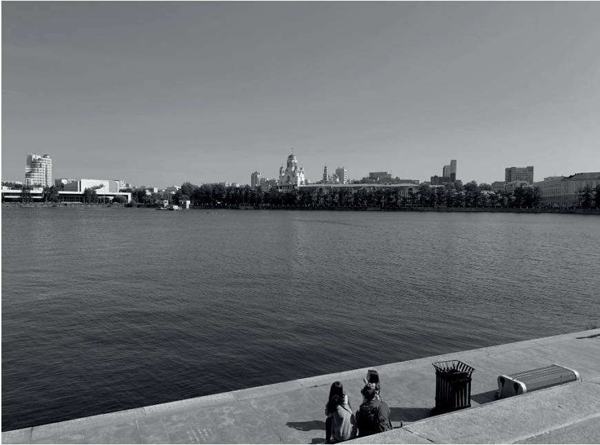
Figure 4. The city pond with several churches in the distance, notably the Church on the Blood in Honour of All Saints Resplendent in the Russian Land, Ekaterinburg (September 2019).