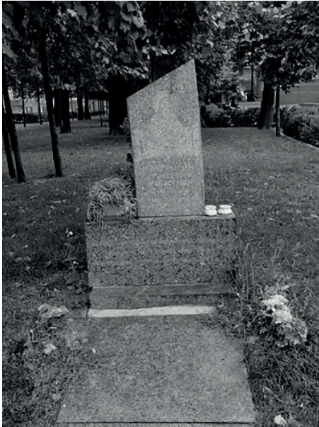
Figure 3. Necropolis, Pushkin square (2020)

Above the gate was a bell tower and the gate to the church of St Alexii the Man of God. The procession stops at important memory places for a short prayer: the apartment building, under the stairs of the cinema hall, and before the Necropolis. Here the members of the community commemorate dead people whose life was connected with the Strastnoy monastery. Among them are the new martyrs of the Strastnoy monastery executed and buried at the Butovo site (ROUSSELET, 2007; CHRISTENSEN, 2018) and dead members of community and unknown people whose bones were found during the renovation of the square in 2013.