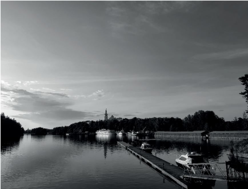
Figure 1. General view of Monastery Bay and Transfiguration Cathedral on Valaam.

In 2016, I arrived at Valaam with a group of tourists gathered in Sortavala, from where regular ferries leave for the archipelago during the summer season. The guide met our group at the pier and led us for several hours along the paths of Valaam, ending the tour at the Transfiguration cathedral. During the few hours of walking, I saw well-kept grounds, beautifully restored chapels and hermitages scattered through the forests of Valaam, clean level paths, and almost no people except for other groups of tourists walking around the island with their guides. Three years later, I was on the island again, but came as a “wild tourist,” independent of the sight and schedule of any guide (MELNIKOVA, 2021). This time the landscape of Valaam struck me even more—with its wildness, splendor, and desolation.