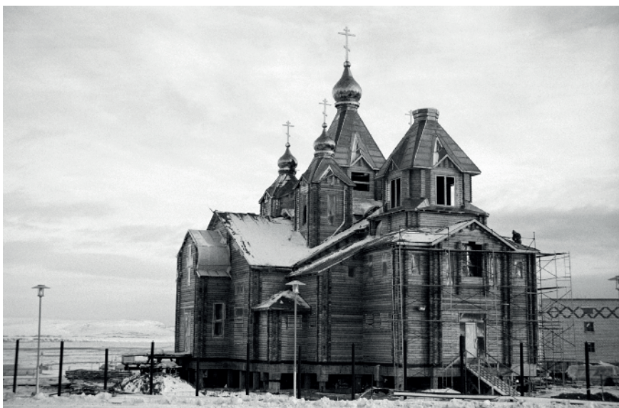
Figure 2. Cathedral of the Holy Trinity Source of Life while under construction, Anadyr (October 2004).