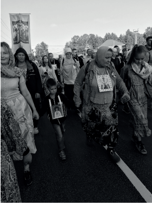
Figure 2. Krestokhodtsy with icons of Tsar Nicholas and Prince Alexey, Ekaterinburg (July 2018).