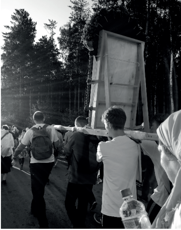
Figure 1. Krestokhodtsy carry an icon from the Church on Blood to Ganina Yama, Ekaterinburg (July 2018).