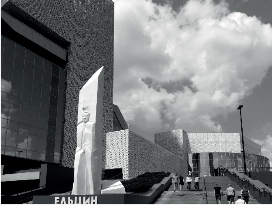
Figure 2. The El'tsin Centre, Ekaterinburg (September 2019).

call for a poll. 2 Following the poll on October 13, 2019, in which over 100,000 people participated, it was decided to build St Catherine's cathedral on the site of an old hardware factory. 3