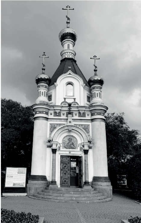
Figure 3. St Catherine's chapel, built for the city's 275th anniversary, Ekaterinburg (September 2019).

the relics of a local saint, St Simeon of Verkhotur'e. From 1960, the fountain Stone Flower, named after a fairytale by Pavel Bazhov, has stood at the same location. In 1997, the wooden cross was replaced by a metal cross: a chapel was built for the city's 275th anniversary thanks to a charitable foundation, the Institute of History and Archaeology, created by city economists, historians and business leaders. 7 The chapel was consecrated on December 7, 1998.