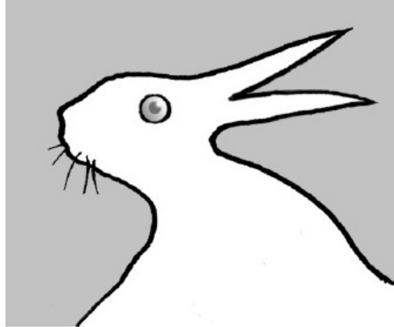
Figure 1: What do you see?