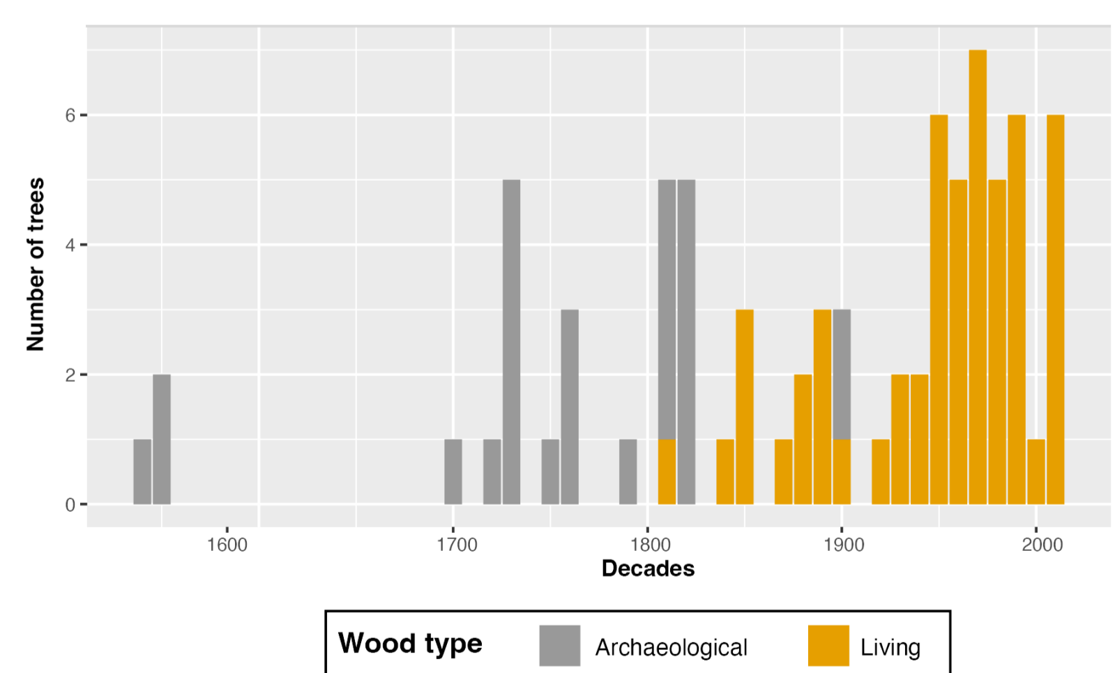
Fig. 3: Decadal disturbance reconstruction based on tree-ring from archaeological and living wood. Chart: M. Saulnier.

We compared indicators of forest practices and management obtained from dendrochronological analyses (cross-dating (Fig. 2), growth profiles, and opening phases (Fig. 3)) with historical data. We reconstructed some probable exploitation phases of the Barrada forest and the surrounding fir forests, while the historical results show that the forest is essentially pastoral but also reveal the occasional harvesting of wood for local construction.