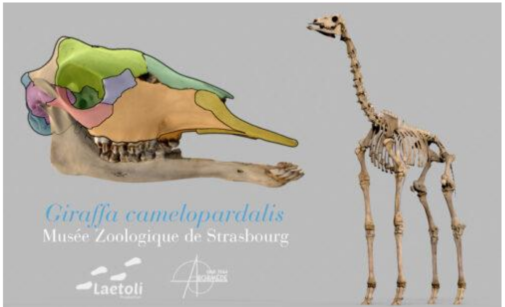
Fig. 1: Visualisation of the mounted skeleton of a giraffe ( Giraffa camelopardalis MZS Mam11097, Musée Zoologique de Strasbourg), with a skull where all individual bones are highlighted.

Data enhancement : for each specimen, individual bones are mounted virtually into a complete 3D skeleton, taking into account all anatomical connections and joints. For some of them the skull is virtually dissociated into all distinct bones that compose it (fig. 1). A set of metadata is added that gives information about the taxonomic group the specimen belongs to, as well as about the evolutionary homologies (i.e. structure similarities in different species of organisms based upon their descent from a common ancestor) of its components. They can also tell the history of the digitized specimen itself.