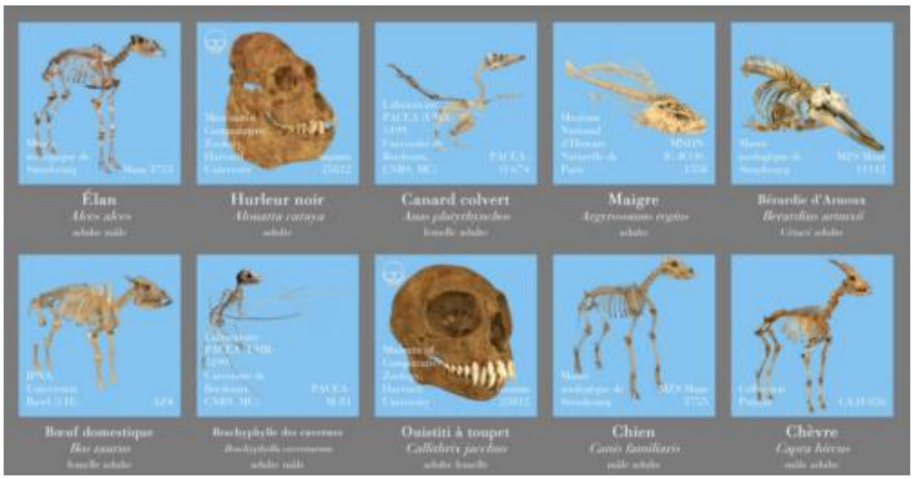
Fig. 6: Screenshot of the entry page of the application.

Thirty two mounted specimens are currently available (fig. 6). They include several Primates (humans, western gorilla, chimpanzee, Guinea baboon, orangutan), Carnivores (dog, European bear, Eurasian lynx, European otter, seal, sea lion), Ruminants (cattle, goat, saiga antelope, chamois, moose, giraffe), Perissodactyls (horse, black rhinoceros), a hippopotamus, an Arnoux's beaked whale, a bat (Antillean fruit-eating bat), a platypus, a Bird (mallard duck), an Amphibian (edible frog) and a bony fish (ray-finned fishes: meagre).