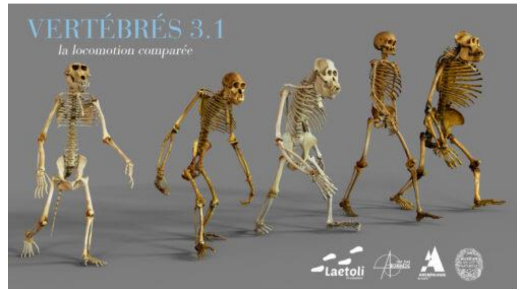
Fig. 8: 3D animation of comparative locomotion for five Primates: baboon, chimpanzee, orang-utan, human and gorilla.

From a more practical point of view, the application allows the virtual mounting of the specimens which have been individually scanned from a set of bones that are not supposed to be mounted immediately. Mounting of skeletons is a delicate and expensive process which is only achieved for specimens to be displayed, such as in a museum. Most skeletal remains in collections are stored in bulk with minimal encumbrance since space is always limited in museum storage places. From a more practical point of view, the application allows the virtual mounting of the specimens which have been individually scanned from a set of bones that are not supposed to be mounted immediately. Mounting of skeletons is a delicate and expensive process which is only achieved for specimens to be displayed, such as in a museum. Most skeletal remains in collections are stored in bulk with minimal encumbrance since space is always limited in museum. Most skeletal remains in collections are stored in bulk with minimal encumbrance since space is always limited in a suspensive process which is only achieved for specimens to be displayed, such as in a museum. Most skeletal remains in collections are stored in bulk with minimal encumbrance since space is always limited in museum storage places. Last but not least, as the application is available online to anybody interested, it offers the lay public an opportunity to visit a small but thorough museum from their sofa!