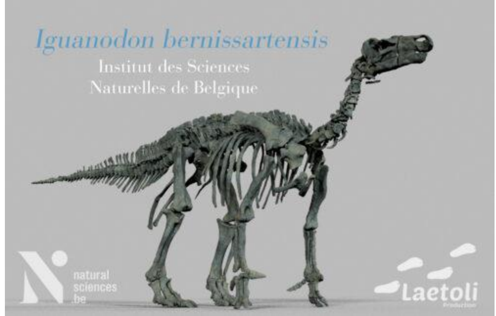
Fig. 7: Skeleton of a fossile iguanodon ( Iguanodon bernissartensis , Institut des Sciences naturelles de Belgique).

The material was provided by the Musée Zoologique de Strasbourg, Archéologie Alsace, the Putelat collection, the University of Bordeaux, the Museum of Comparative Zoology of Harvard, the Musée national d'Histoire Naturelle du Luxembourg and the Muséum National d'Histoire Naturelle in Paris.