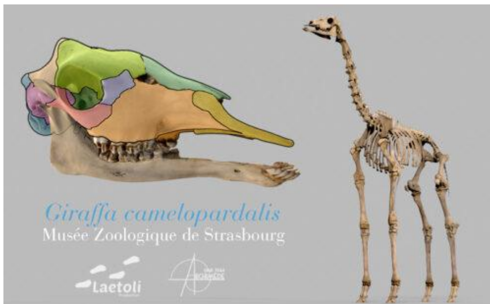
Fig. 1: Visualisation of the mounted skeleton of a giraffe ( Giraffa camelopardalis MZS Mam11097, Musée Zoologique de Strasbourg), with a skull where all individual bones are highlighted.

Data enhancement: for each specimen, individual bones are mounted virtually into a complete 3D skeleton, taking into account all anatomical connections and joints. For some of them the skull is virtually dissociated into all distinct bones that compose it (fig. 1). A set of metadata is added that gives information about the taxonomic group the specimen belongs to, as well as about the evolutionary homologies (i.e. structure similarities in different species of organisms based upon their descent from a common ancestor) of its components. They can also tell the history of the digitized specimen itself.