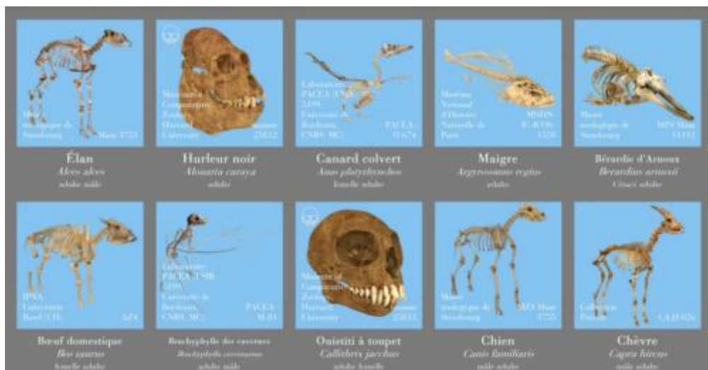
Fig. 6: Screenshot of the entry page of the application.

Thirty two mounted specimens are currently available (fig. 6). They include several Primates (humans, western gorilla, chimpanzee, Guinea baboon, orangutan), Carnivores (dog, European bear, Eurasian lynx, European otter, seal, sea lion), Ruminants (cattle, goat, saiga antelope, chamois, moose, giraffe), Perissodactyls (horse, black rhinoceros), a hippopotamus, an Arnoux’s beaked whale, a bat (Antillean fruit-eating bat), a platypus, a Bird (mallard duck), an Amphibian (edible frog) and a bony fish (ray-finned fishes: meagre).