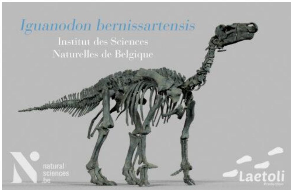
Fig. 7: Skeleton of a fossile iguanodon ( Iguanodon bernissartensis , Institut des Sciences naturelles de Belgique).

The material was provided by the Musée Zoologique de Strasbourg, Archéologie Alsace, the Putelat collection, the University of Bordeaux, the Museum of Comparative Zoology of Harvard, the Musée national d'Histoire Naturelle du Luxembourg and the Muséum National d'Histoire Naturelle in Paris.