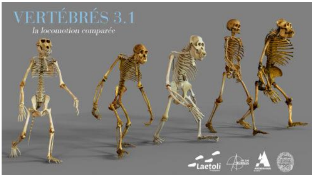
Fig. 8: 3D animation of comparative locomotion for five Primates: baboon, chimpanzee, orang-utan, human and gorilla.

From a more practical point of view, the application allows the virtual mounting of the specimens which have been individually scanned from a set of bones that are not supposed to be mounted immediately. Mounting of skeletons is a delicate and expensive process which is only achieved for specimens to be displayed, such as in a museum. Most skeletal remains in collections are stored in bulk with minimal encumbrance since space is always limited in museum storage places. From a more practical point of view, the application allows the virtual mounting of the specimens which have been individually scanned from a set of bones that are not supposed to be mounted immediately. Mounting of skeletons is a delicate and expensive process which is only achieved for specimens to be displayed, such as in a museum. Most skeletal remains in collections are stored in bulk with minimal encumbrance since space is always limited in museum storage places. Last but not least, as the application is available online to anybody interested, it offers the lay public an opportunity to visit a small but thorough museum from their sofa!