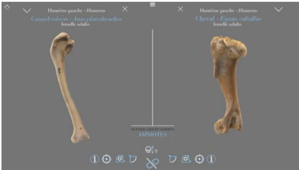
Fig. 2: Comparison between the humeri from a duck and a horse.