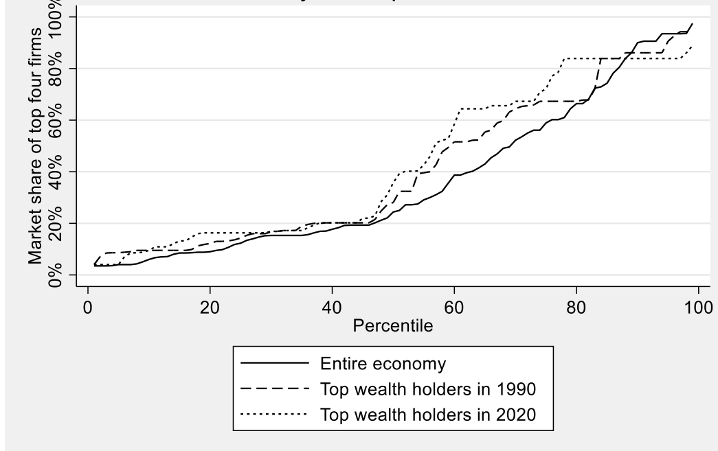
Figure 2: Distribution of market share across the economy and top wealth holders

What explains the greater prevalence of top wealth holders in concentrated industries in 2020 compared with 1990? As noted, our measure of industry concentration is based on a single point in time, so our analysis does not take account of changes in concentration over time. Instead, it is driven by the shift in top wealth holders towards more concentrated industries. For example, Table 1 shows that the largest source of top wealth in 1990 was ‘Commercial and industrial building construction’, in which the top four firms have a 9.5 percent market share. In 2020, the largest source of top wealth was ‘Iron ore mining’, in which the top four firms have an 83.9 percent market share. Above-average returns in concentrated sectors may well have propelled some top wealth holders up the rich list rankings.