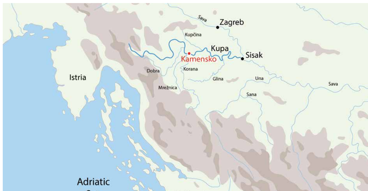
Fig. 1 Position of the Kamensko site (map: V. Dumas, A. Divić)

The Kamensko wreck is that of a flat-bottomed river barge from the Roman period, dated to between the 1 st and 3 rd centuries AD. 1 On its last journey it was transporting a cargo of several hundred construction bricks. Its remains, 2.1 m wide and 12 m long, are located on the riverbed of the Kupa River downstream of Karlovac in Croatia (Fig. 1). The remains consist of two massive bilge strakes, obtained by hollowing out two oak trunks, that form the sides and part of the bottom of the barge. Between them, two bottom strakes made from four planks are inserted.