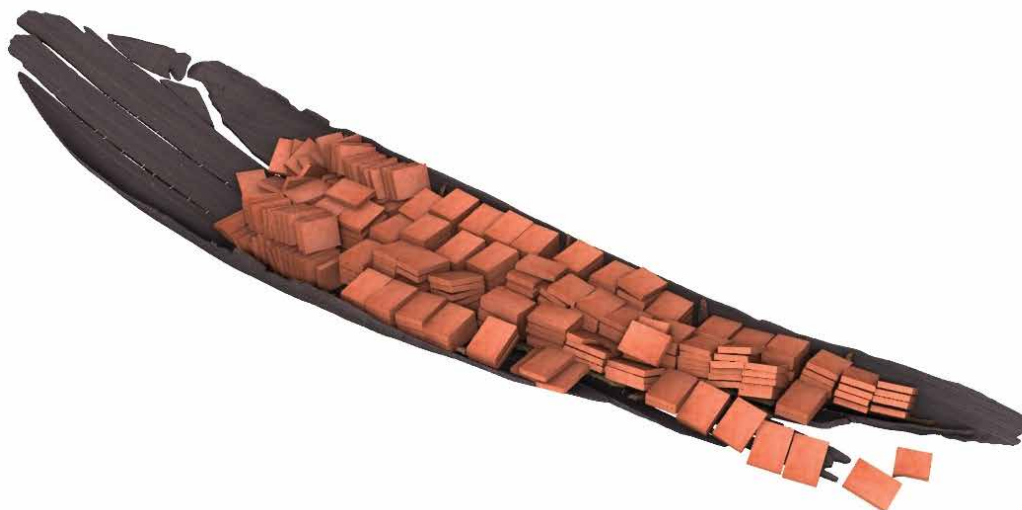
Fig. 2 Three-dimensional CAD model of the preserved remains of the Kamensko barge (CAD: A. Divić)

The first step in this process was the creation of a 3D CAD model of the preserved remains that would serve as the basis for the subsequent reconstruction (Fig. 2). This was achieved mainly through the use of georeferenced three-dimensional photogrammetric models, generated for every stage of the excavation, which served as a base layer for the CAD 3D modelling of the remains in the Rhinoceros software.