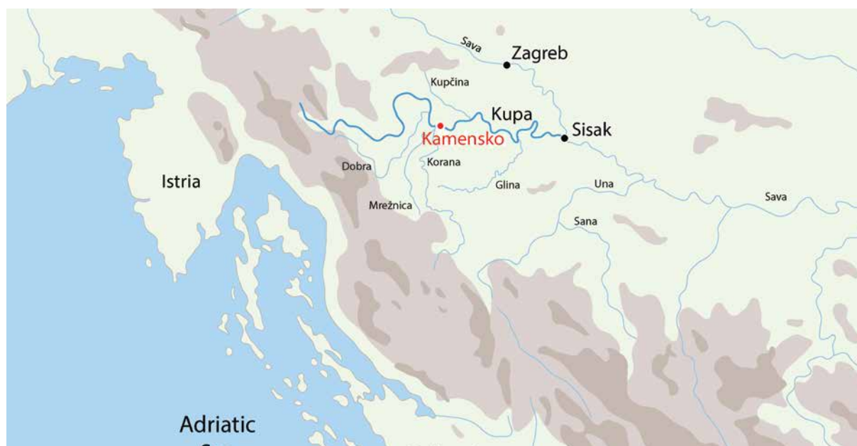
Fig. 1 Position of the Kamensko site (map: V. Dumas, A. Divić)

The Kamensko wreck is that of a flat-bottomed river barge from the Roman period, dated to between the 1 st and 3 rd centuries AD. 1 On its last journey it was transporting a cargo of several hundred construction bricks. Its remains, 2.1 m wide and 12 m long, are located on the riverbed of the Kupa River downstream of Karlovac in Croatia (Fig. 1). The remains consist of two massive bilge strakes, obtained by hollowing out two oak trunks, that form the sides and part of the bottom of the barge. Between them, two bottom strakes made from four planks are inserted.