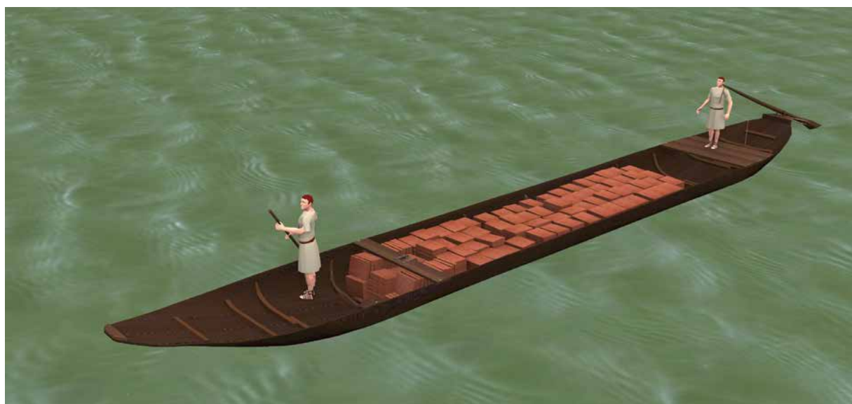
Fig. 3 Hypothetical reconstruction of the Kamensko barge navigating downstream during its last voyage (CAD: A. Divić, P. Poveda)

As seen on the sample of 11 Romano-Celtic barges, their length-beam ratio varies between 1:5.7 and 1:10, with the average ratio calculated at 1:7.4. In practical terms, this would mean that a 1-meter-wide vessel with 1:7.4 beam-length ratio would have the length of 7.4 m. When applied in the case of Kamensko, with its beam conserved in its entirety and measuring 2.10 m, this second hypothesis reconstructs the barge's original length to 15.62 m. Considering the median value of the two length reconstruction hypotheses, the original length of the Kamensko barge is therefore reconstructed to approximately 16 m (Fig. 3).