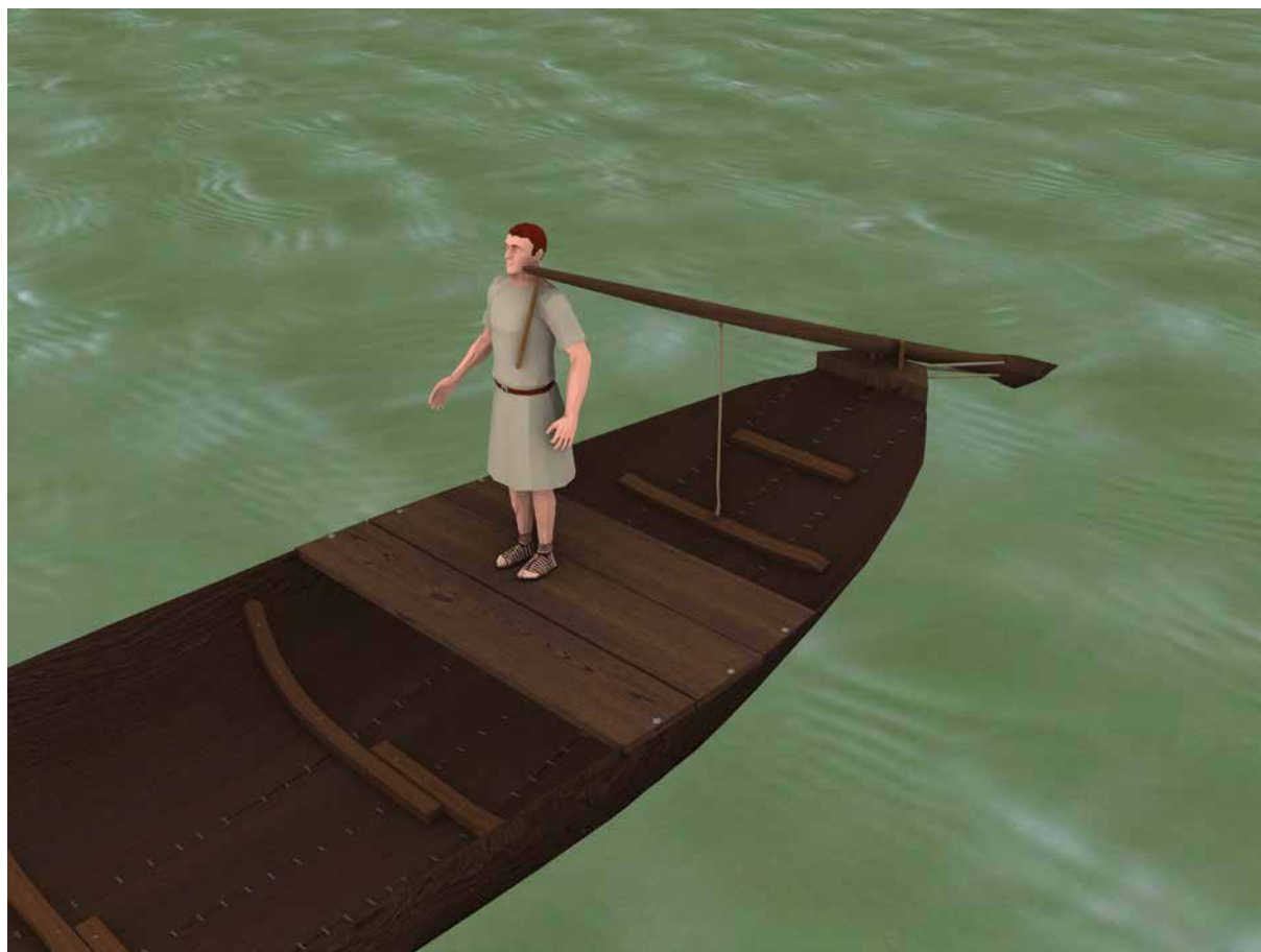
Fig. 5 Reconstruction of the Kamensko steering oar and its attachment system to the stern (CAD: A. Divić, P. Poveda)

In addition to the steering oars from Bevaix (Arnold 1992a: 95) and Arles-Rhône 3 (Marlier, Poveda 2014: 213–214), iconographic representations from the Roman period proved to be a trove of detail regarding the attachment and handling of these devices, in particular the detailed depiction from the 1 st century Cologne stele (Arnold 1992b: 85). Reinforced by a number of ethnographic contributions that testify to the use an axially positioned steering oar within the Kupa basin (Divić 2022a: 101–109), the Kamensko steering oar has been reconstructed as such (Fig. 5).