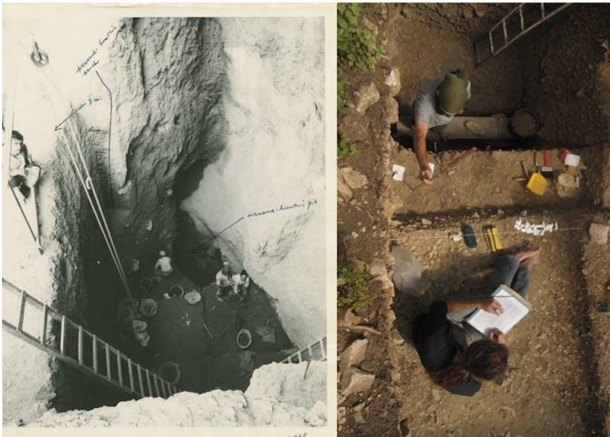
The two archeological sites of Ksar Akil (left) and Grotte Mandrin.