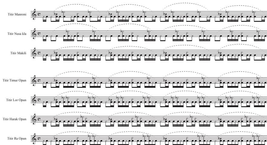
Fig. 10 – Comparison of seven motifs played on the musical bow (transcription–notation Kolia Chabanier, April 2024). Legend — Solid diamond: partial; hollow diamond: melodic line; X: muffled sound. 32

partial on the second sixteenth note of the second and fourth beats, revealing the mastery of great rhythmic finesse. The differences in the motifs testify to a differentiation of territory through the musical bow, a crudely made rudimentary instrument consisting of a single string stretched over a curved stick.