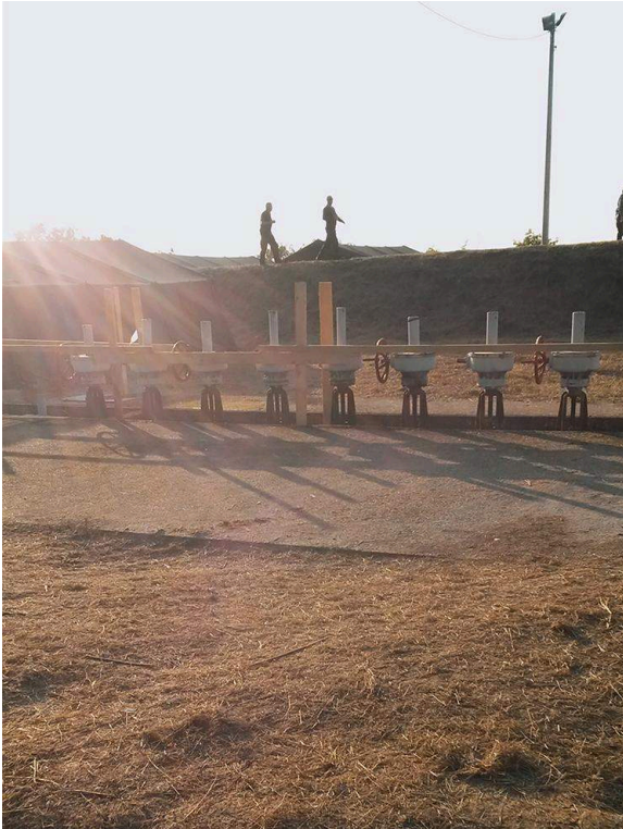
Photograph 4: Patrols along the Old Pipeline

Credit: M. Dujmovic, 3 October 2015, Opatovac.