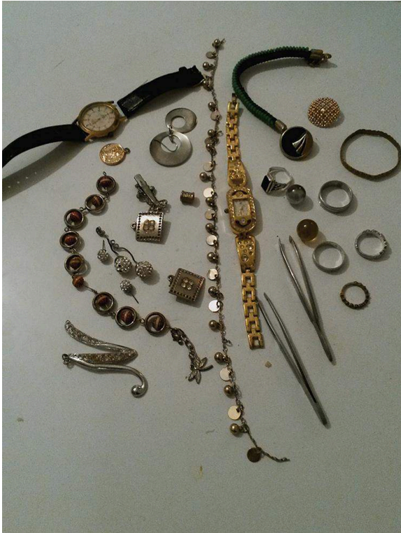
Photograph 7: Ružica's Treasure Box

Credit: M. Dujmovic, 8 December 2015, Tovarnik.