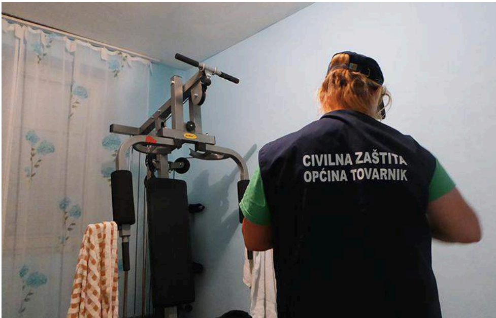
Photograph 6: Going to Work at the Camp

Credit: M. Dujmovic, 30 September 2015, Tovarnik.