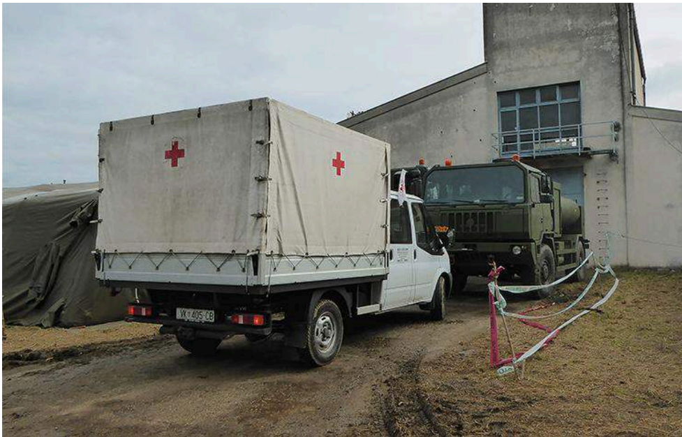
Photograph 3: The Humanitarian-Security Continuum

Credit: M. Dujmovic, 30 September 2015, Opatovac.