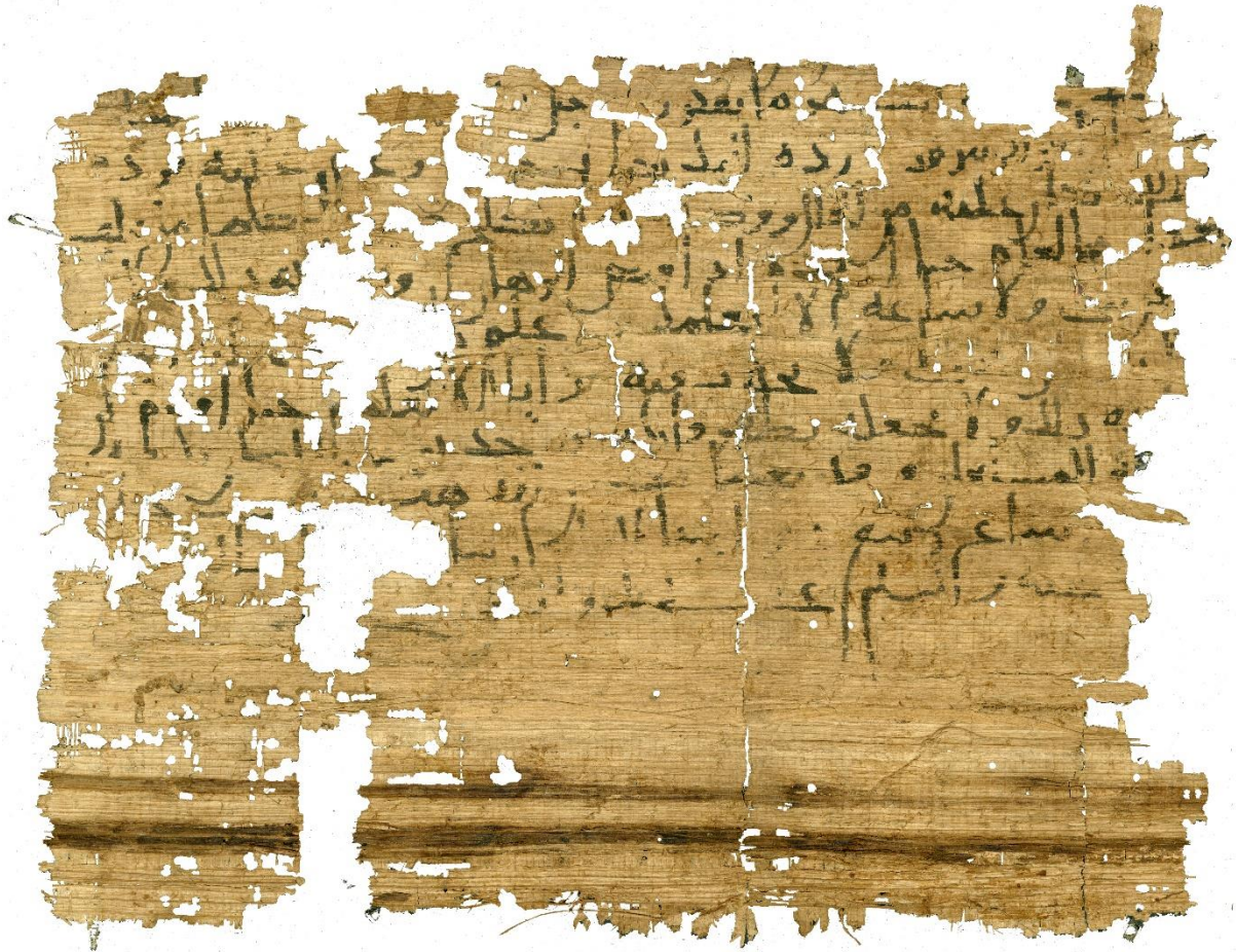
Plate 2. P. Utah Inv. 114 side B