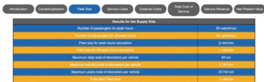
Fig. 12.2 EASI-AV web application fleet size results—example of an AVENUE testing site.

For this part, information about the lifetime of the vehicles as well as the number of onboard safety drivers and off-board supervisors are requested. The former will allow for the calculation of vehicle depreciation, while the latter two will allow a better characterization of operating costs and possible economies of scale in terms of required staff.