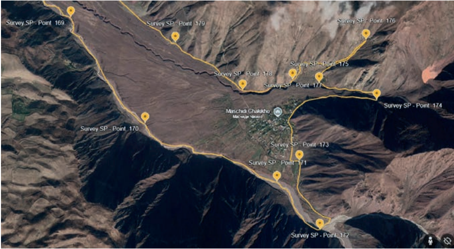
Figure 2. The survey points (SP) covered by the aerial survey.