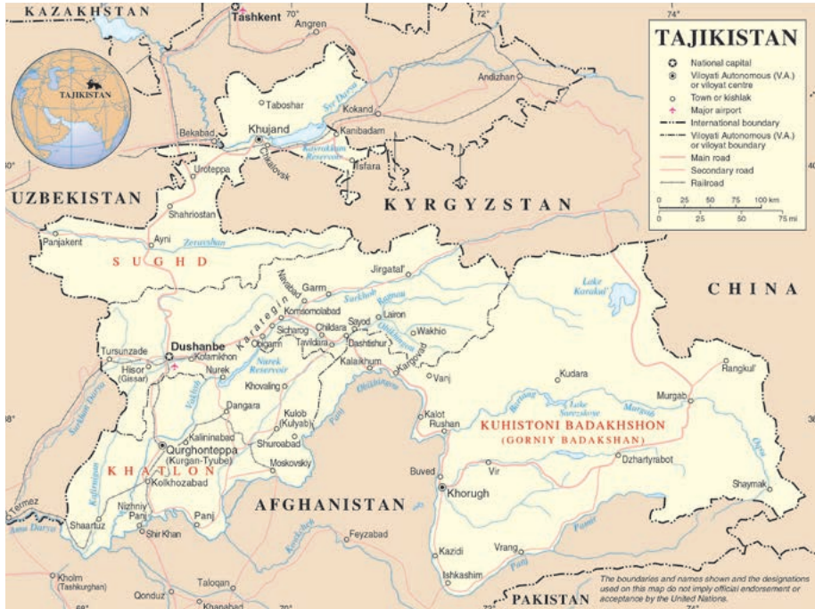
Figure 1. The Karategin Valley in central Tajikistan, between Garm and Jirgatal.

and, crucially, it will help quantify human settlements during that time. Initiated in 2022, further work is still required to complete the database, but it has already revealed the close network of fortresses and settlements along the northern and southern routes in the Tarim Basin.