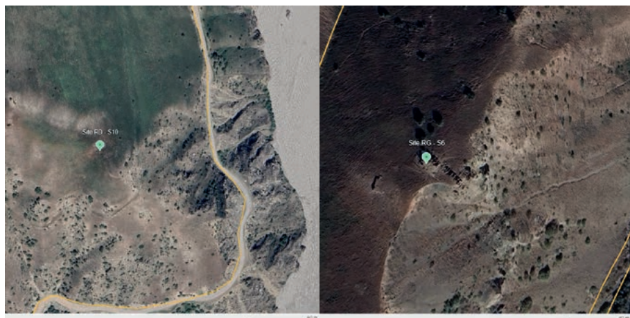
Figure 5. Examples of surveyed possible sites, RD S10 and RG S6.

the higher part of the valley, close to the villages of Lâhš and Oksai (Yakubov, 1984, 1986; Yakubov and Mullokandov, 1987). The material (jewellery, weaponry) found in these tombs clearly dates from Antiquity. In one of the tombs, an exceptional silver bowl decorated with Indian-style iconography was unearthed. This object testifies to the strong cultural links between this region and the Indian world.