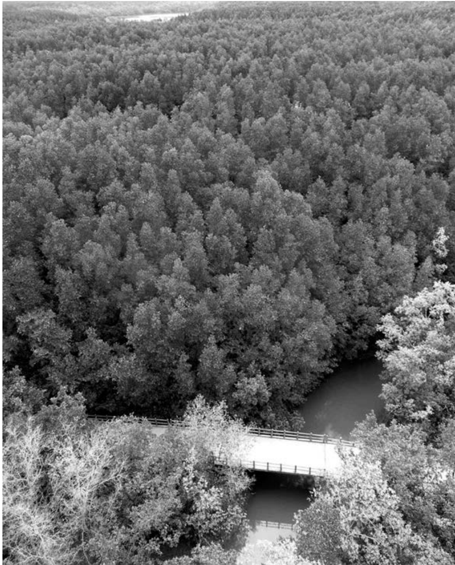
Figure 2 : Photo of the Vietnam mangrove forests: the contrasted mangrove-scape testifies the contrasted management regime CanGio mangrove, South Vietnam (Cormier-Salem@ird, 2015)

and to protect the mangrove forest. To-day, there are 160 protective families, every family is responsible of on average 80 ha (the smallest protected forest is 25 ha and the biggest, 300 ha). They could conserve their charge as long as they fulfill their duty.