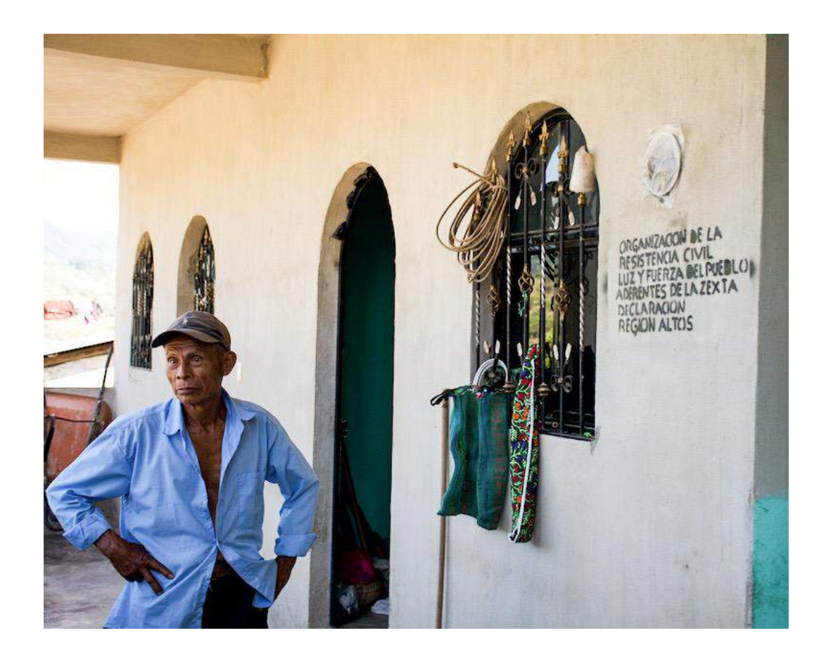
<u>Photo 2. Taniperla.</u> The just painted seal of Luz y Fuerza del Pueblo. To note the he electricity meter missing just above the seal.

This practice started in 2012. The original purpose was to legitimate and increase the "bargaining power" of the Organization, during some undergoing negotiations with the CFE at the time. The electric utility company refused to hold to be true to the overall number of members Luz y Fuerza's representatives claimed to represent. In response, the Organization decided to clearly and permanent mark the houses of every single member, in order to visually impact the CFE counterparts and prove to them the actual size of the Organization. The expedient resulted successful at the time of the negotiations, as we will further detail. Later, the mark keeps offering a sort of protection, first of all from the interventions of the CFE workers, always in search of "abusive" users to cut off from the grid. But also and more generally, it is a warning to any authority and to any ill-intention that the family living in that home is organized, it is not alone, it is part of something "bigger and wider". Each region has an own stencil, which is guarded and managed by the regional board. In the event that a compañero leave the Organization (for his spontaneous choice or because expulsed) the seal is