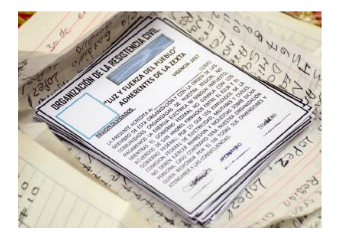
<u>Photo 3. Venustiano Carranza.</u> An ID card of Luz y Fuerza del Pueblo.

This picture shows a credencial from Olvidados region, for the year 2017: