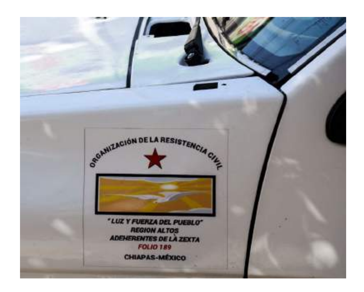
<u>Photo 4. San Cristobal de las Casas.</u> A car sticker of Luz y Fuerza del Pueblo.

I took it on January 2017, at the assembly of the region, event during which the ID documents for the new year were distributed to the community representatives, that in turn will have them delivered to their represented. The documents have a validity of only one year to facilitate the management and the control on this "civil registry" task, by the board of each region, which is responsible for it. Moreover, while driving a vehicle, the document exempts – de facto , by decision of the Organization - the driver from the obligation to hold a driving licence (which in Mexico is a mere administrative act, not requiring any theoretical or practical training and not even an examination) and from the payment of all taxes related to the vehicle (under the condition that the vehicle is in order, in particular not stolen, and not used for illicit purposes). All the members owning a vehicle may request for a sticker of the Organization and the region of origin. They have a similar function to the seal in the house. The following is a sticker from the Altos region, that I photographed in November 2016, during a march held by the Organization in San Cristobal de las Casas: