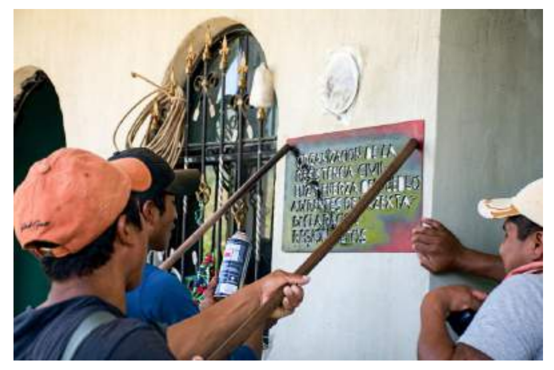
<u>Photo 1. Taniperla.</u> Three compañeros in the act of sealing the house of a new activist.

Emiliano mentioned the act of sealing the house of the "bad" fellow, at a point. The rules set that every member should have a seal of the Organization painted at the façade of his house (i.e. the household where the meter has been removed and directly connected to the grid). The seal mentions: « Organization of the Civil Resistance Luz y Fuerza del Pueblo - Adherent of the 6th Declaration of the Selva Lacandona - Region "x" » (where "x" is for the name of the region of Luz y Fuerza where the household is located). I took the pictures that follow during the operations of sealing in the community of Taniperla (Municipality of Ocosingo), in March 2017: