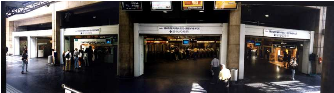
Gare Montparnasse – Underground level / entry-exit of subway