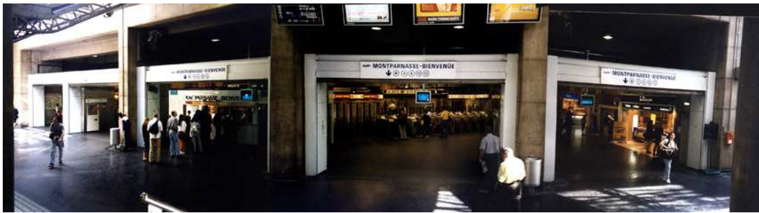
Gare Montparnasse – Underground level / entry-exit of subway