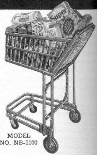
MODEL NO. NB-1100