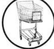
The NEST-KART with the Huge Capacity