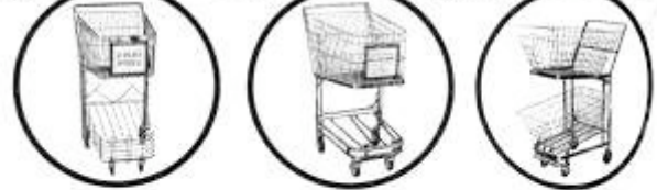
For the Average Sized Market The NEST-KART with the Huge Capacity Usable with Any Type of Check-Out Counter

*NEST-KART is the copyrighted trade mark of Folding Carrier Corp. NEST-KARTS are made under U. S. Patent No. 2479530—a valuable safeguard for users.