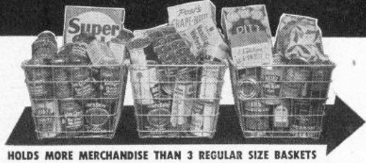
HOLDS MORE MERCHANDISE THAN 3 REGULAR SIZE BASKETS