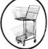
Usable with Any Type of Check-Out Counter

1 NEST-KART is the copyrighted trade mark of Folding Carrier Corp. NEST-KARTS are made under U. S. Patent No. 2479530—a valuable safeguard for users.