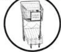
For the Average-Sized Market