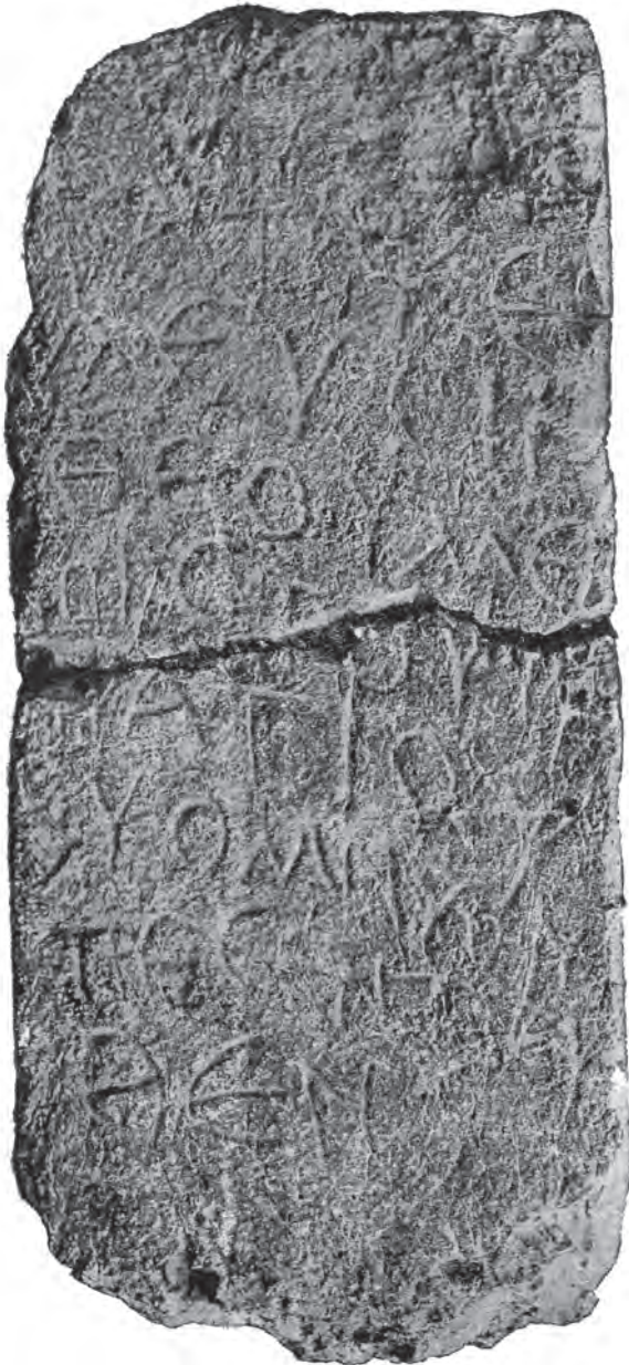
Plate X Greek inscription from Qasr Antar in the British Museum. After Clermont-Ganneau (1903b), pl.VIII.