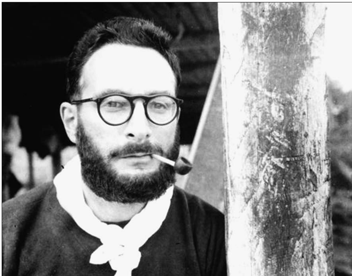
Fig. 1. The young Lévi-Strauss as fieldworker and adventurer.