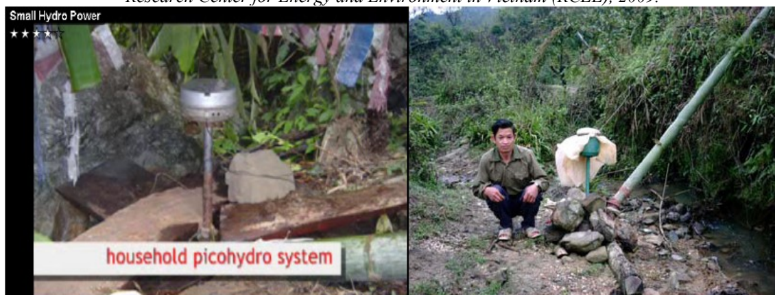
Figure 4: Many mini hydropower stations are built using individual investments and managed by individual households. They often use outdated technologies and tend to be very inefficient.

industrial capability form the second most important major barrier to the penetration of geothermal energy technology.