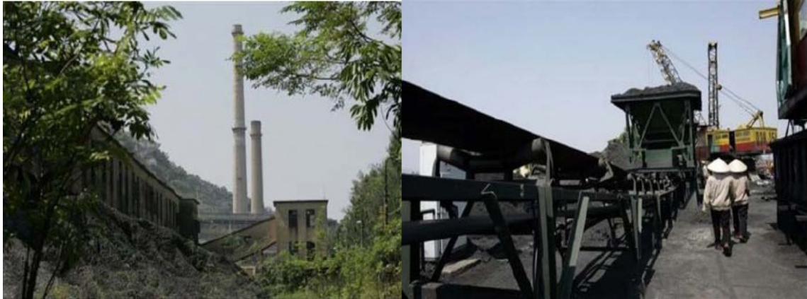
Figure 1: The Ninh Binh conventional coal-fired power plant was constructed over 20 years ago and continues to use outdated technology.

To meet the increasing demand for electricity services expected in 2010–2030, Vietnam can rely largely on domestic coal reserves, which were estimated at 3.8 million tons as of January 2002 and are 85% anthracite coal (heat value ranges between 5200 kcal/kg and 5700 kcal/kg). Over the period of 2002–2020, the qualified coal yield is expected to increase from 13.8 million tons to 30 million tons per year, and it could reach 40 million tons per year in 2030. To exploit this resource, an intense generation capacity expansion plan based on coal-fired generation is already underway (Institute of Energy, 2006, 2007). So far, all coal-fired generating plants that have already been committed to and those planned in the years leading up to 2015 are based on conventional pulverized and circulating fluidized bed technologies. Advanced and cleaner coal-fired technologies such as IGCC and PFBC are not yet included in the long-term generation capacity expansion development master plan. If barriers to the adoption of these technologies can be overcome, overall efficiency will be significantly increased.