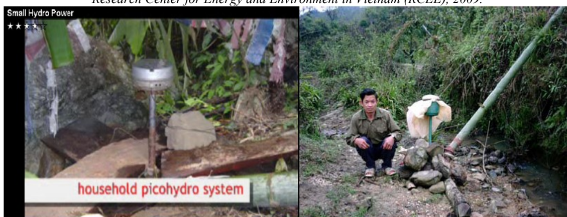
Figure 4: Many mini hydropower stations are built using individual investments and managed by individual households. They often use outdated technologies and tend to be very inefficient.

industrial capability form the second most important major barrier to the penetration of geothermal energy technology.