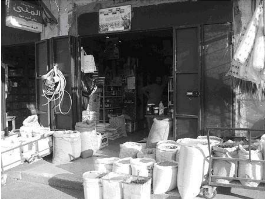
Photo 3: A shop at the border of al-Buss camp near Tyre