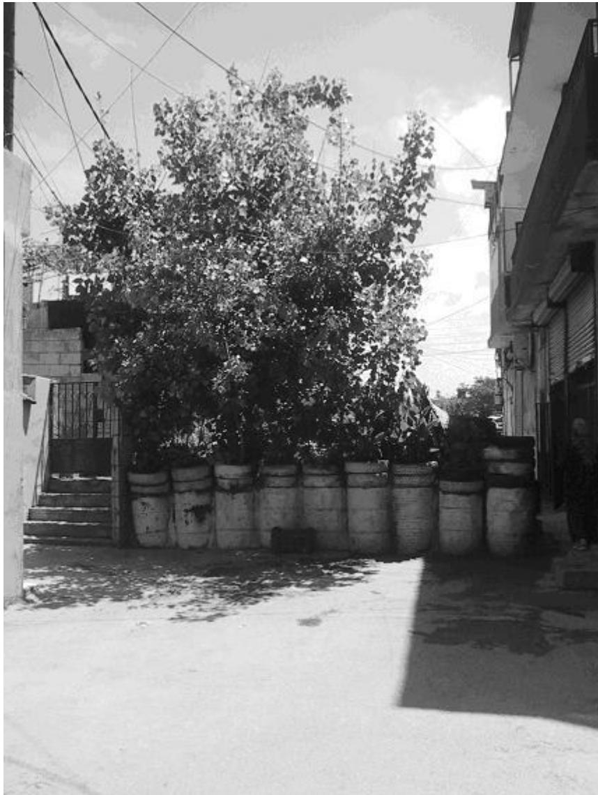
Photo 1: A closed road in al-Buss Camp near Tyre