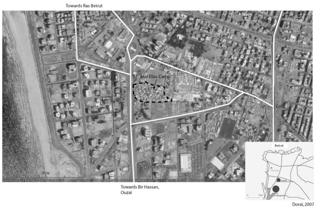
Map 1: Location of Mar Elias Refugee Camp

Mar Elias camp was created in 1952 by UNRWA, on an area of 5,400 square meters in the southwest part of the Beirut municipality. In 1958, according to UNRWA figures, the camp hosted 449 registered refugees and 612 in 2005. 14 The camp was established adjacent to Mar Elias Greek Orthodox convent. Today, the camp is situated at the crossroads between Beirut's southern suburbs of Bir Hasan and Uza'i on the one hand and Ras Beirut and Cola intersection on the other (see Map 1). This central location facilitates circulation both for camp dwellers who can easily reach other neighbourhoods in Beirut and for people from outside the camp wishing to come to the camp, whether they are from Beirut or from other regions of Lebanon (especially the southern coastal region).