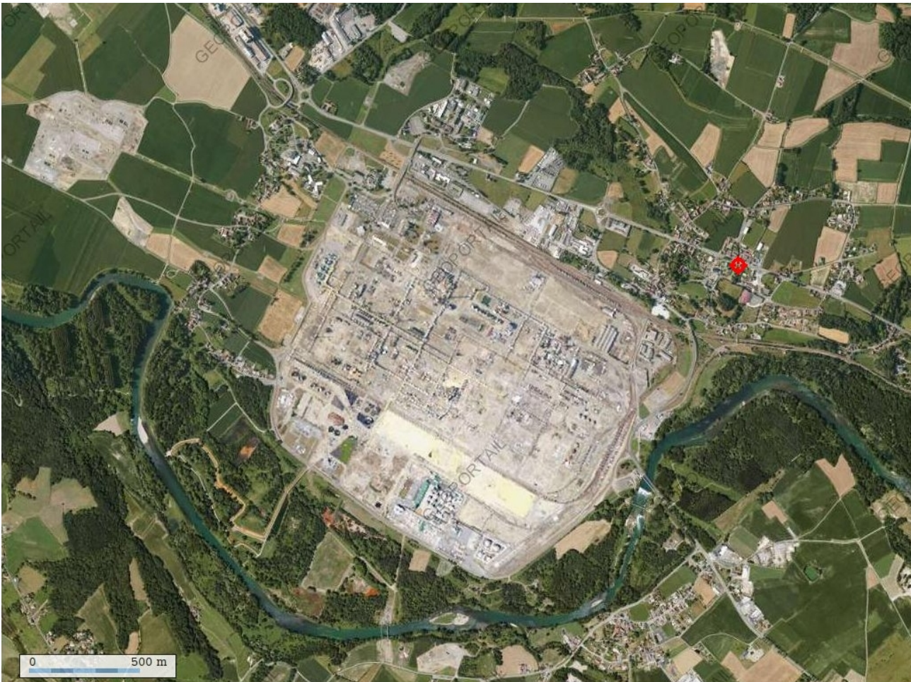
Illustration 1: Aerial view of the Lacq natural gas processing plant. Empty lots show the decline in industrial activity. Industrial risk and harmful effects do not prevent people from living close to the site (red dot).