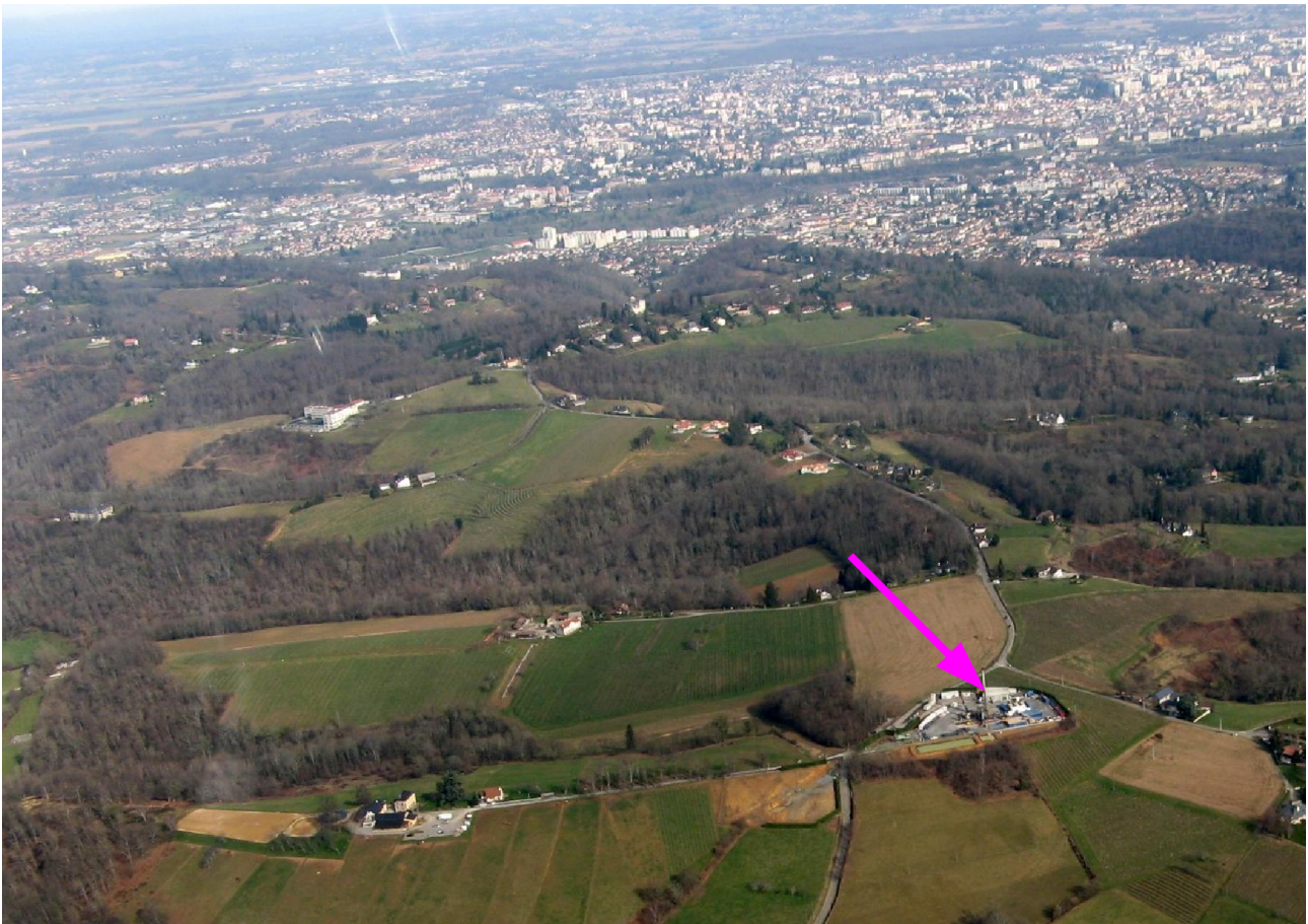
Illustration 2: Aerial view of the Rouse 1 CO 2 injection site in 2009, busy with equipments revising the well before injection (arrow). Surrounding landscape is hills covered with low density residential lots, vineyards, fields and patches of wood. In the background the cities of Jurançon and Pau are at approximately 5 km.

live very close as Illustration 1 shows. The risk is not only present near the plant. The gas field extends dozens of kilometers beyond Lacq, reaching under the city of Pau. Consequently there is a wide network of collection pipelines in the area. These may have a low impact for newly installed inhabitants. But local citizens can have a memory or direct knowledge of the visual, air and noise pollutions that come from living in a valley rich in heavy industries [2]. Local institutions have experience with managing dangerous gases and pipelines risks.