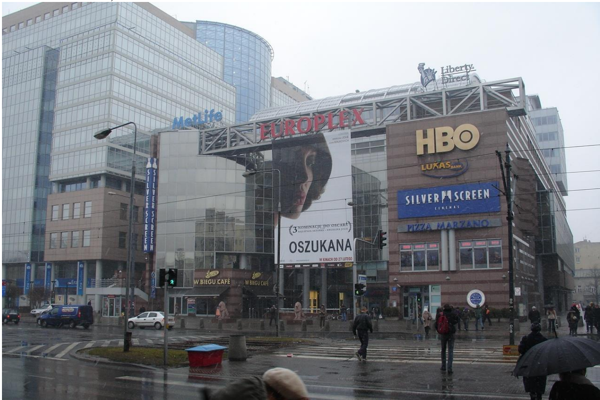
Figure 7 : The Silver Screen Building, instead of the Moskwa Cinema, Warsaw. LCL, 2009