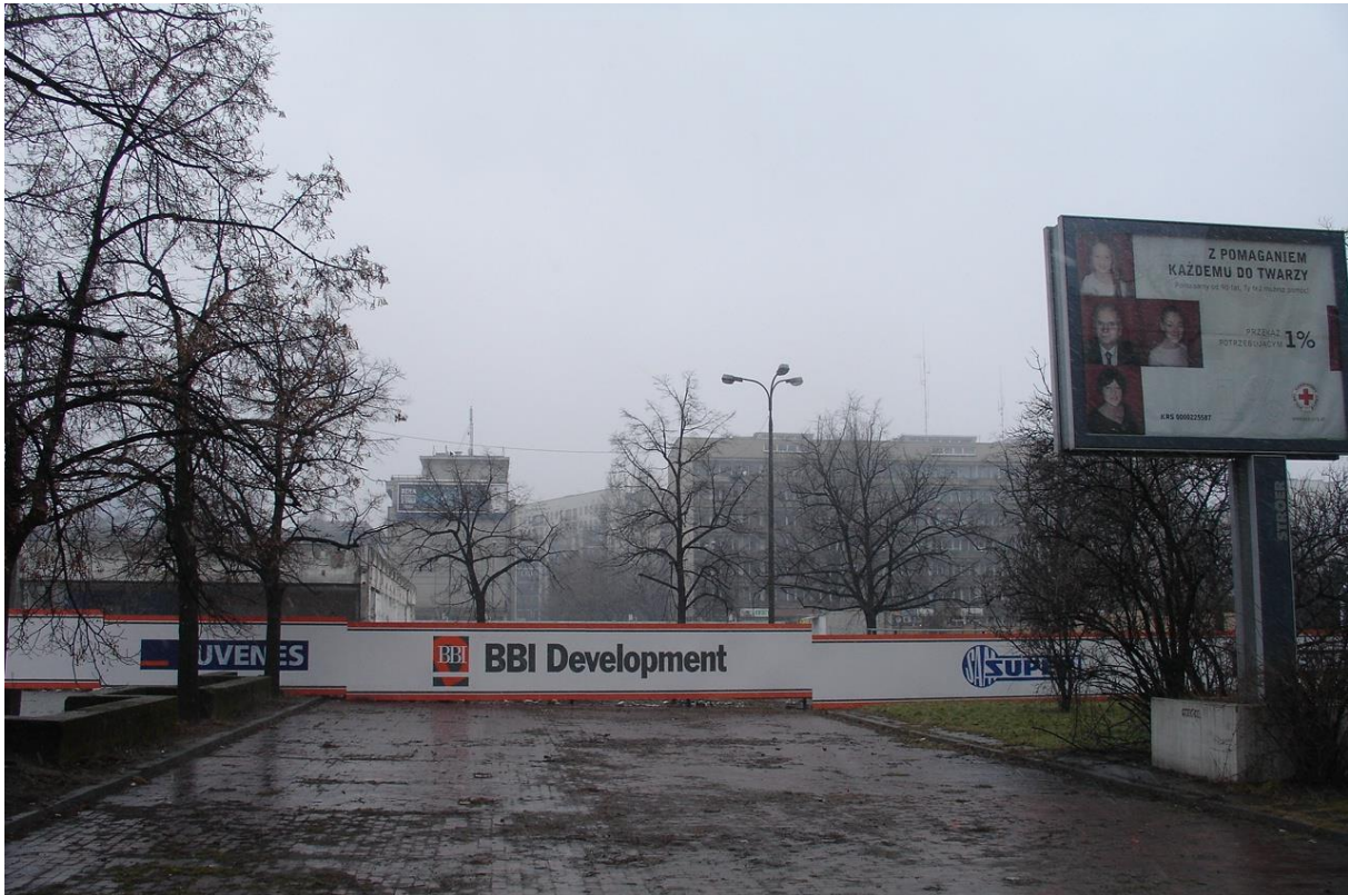
Figure 10: The Plac Unii Lubelskiej without Supersam, Warsaw. LCL, 2009.