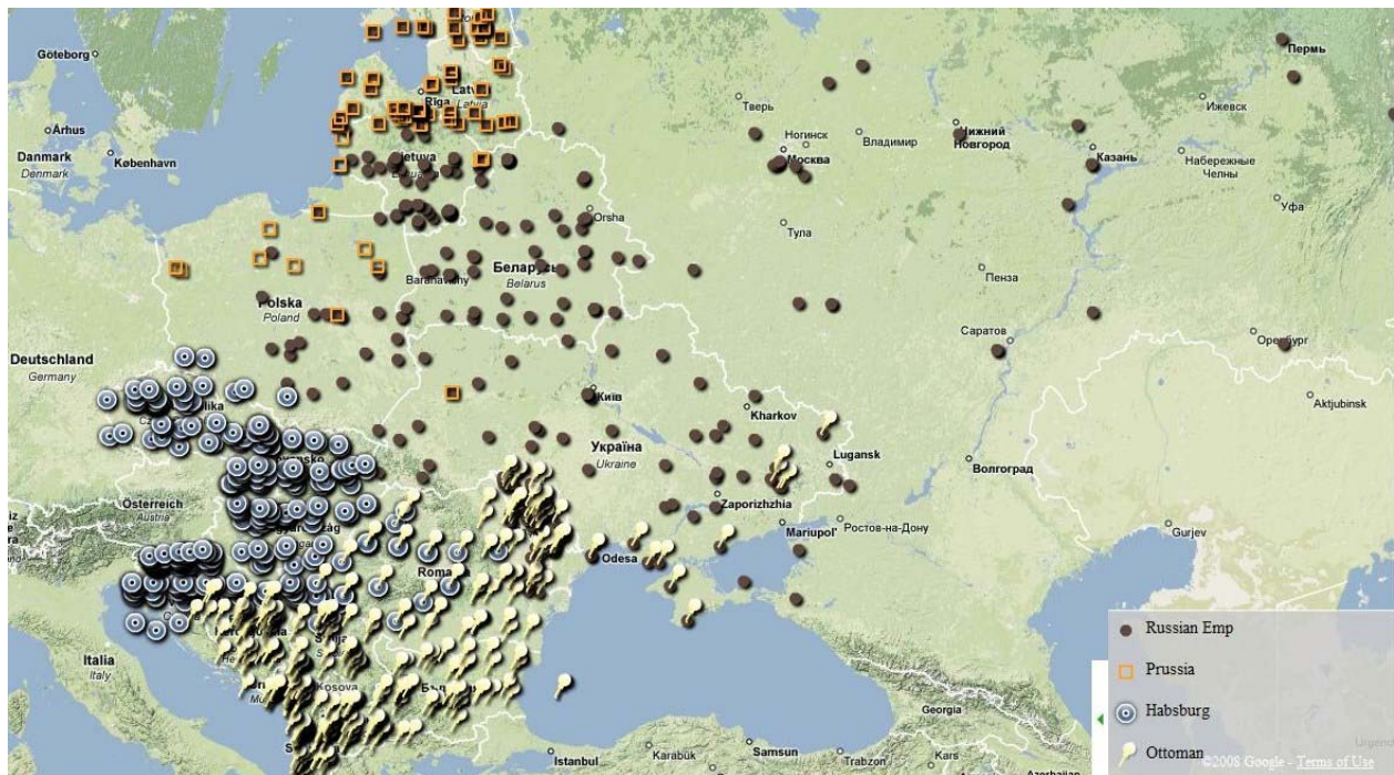
Figure A1. Map of Dynastic Empires in Central and Eastern Europe