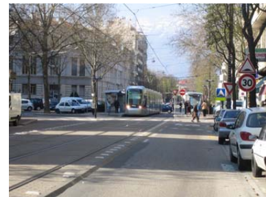
The landscaped setting of the Ile Verte neighbourhood

However the walkability of these districts should not only be judged by their landscaped or commercial attractiveness. On the contrary, walking is the result of a complex combination of conditions determined by practical possibilities, the pedestrian's own wishes and the ability of the environment to stimulate perception.