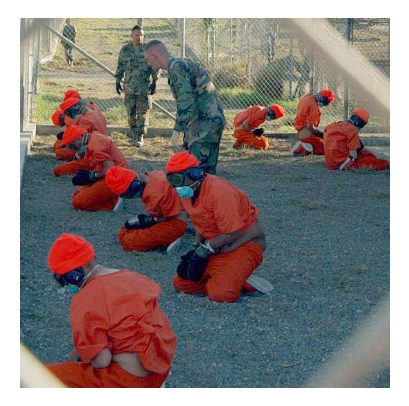
Figure 9.2 Detainees at Guantanamo Bay's Camp X-ray.<sup>18</sup>

As the authors remark, one of the salient features of contemporary political torture is the importance of the camera, both as a means of reinforcing the victim's humiliation and as an instrument for the objectification of state power. The images leaked to the media from Abu Ghraib are striking in at least two respects. First, they were clearly taken by the torturers for their own, collective gratification as they performed for an audience that was none other than themselves. Second, they are highly stylized, almost burlesque, portraying torture in a way that verges on theatrical performance and brings various religious, artistic, and pornographic associations to mind. While attesting to the reality of the abusive, depersonalizing treatment to which the prisoners were subjected, these images are at the same time dramatically overstaged. They contrast sharply, for example, with the quiet, anonymous horror recorded in the Wikipedia photograph of detainees upon their arrival at Guantanamo Bay's Camp X-ray (Fig. 9.2).