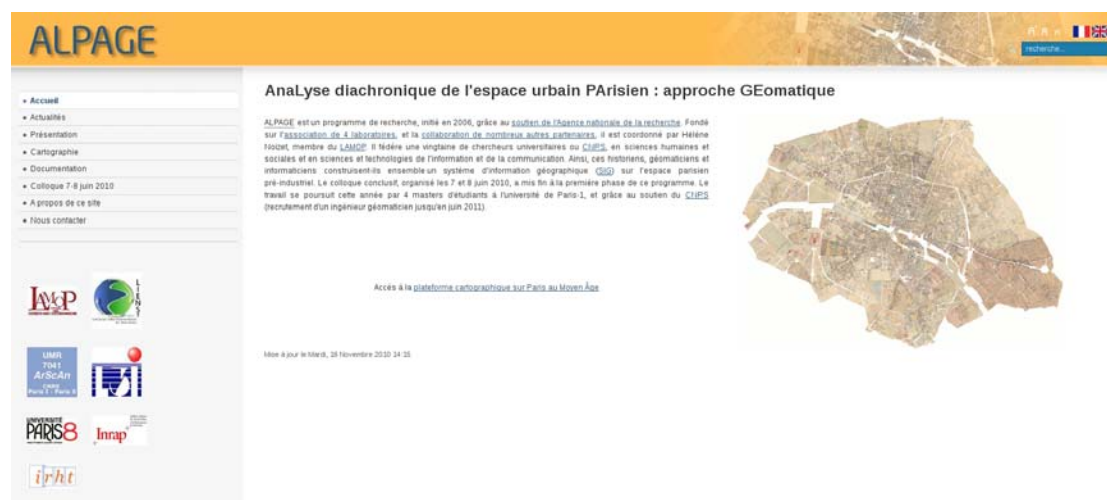
Figure 4. Website of the ALPAGE project.

From a technical point of view, this webmapping platform allows us to publish online new data, to manage metadata, and allows everyone to consult the published data. An online centralised database, entitled ALPAGE-References, enables us to reference the sources that aim to spatialise the historical objects.