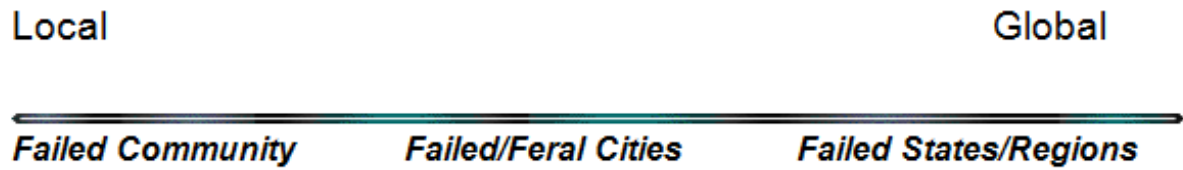
Figure 1: Governance (State) Failure Continuum

Source: John P. Sullivan, «Intelligence, Sovereignty, Criminal Insurgency, and Drug Cartels», Panel on Intelligence Indicators for State Change and Shifting Sovereignty, 52nd Annual ISA Convention, Global Governance: Political Authority in Transition , Montreal, Quebec, Canada, 18 March 2011