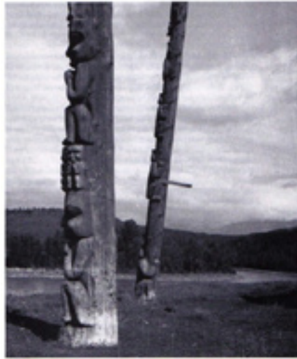
Fig. 5. Kurt Seligmann, Kispiox totem pole, published in Minotaure 12-13 (May 1939). © 2008 Artists Rights Society

not record any specific intercourse with natives. It may well be that villages were deserted as people had gathered along the coast to work in canneries. In any case, it is my contention that Paalen was more interested in the Northwest culture as an object of study rather than with living people in a poor economic predicament. His reflection on Northwest Coast culture draws on written documentation as well as on objects rather than on fieldwork observations. As a fervent collector, Paalen is more concerned with scouring every curio shop he happens to discover, and hunting for artifacts rather than with recording myths and talking to people. As a matter of fact, Paalen's "diary" is full of notations about his latest acquisitions: