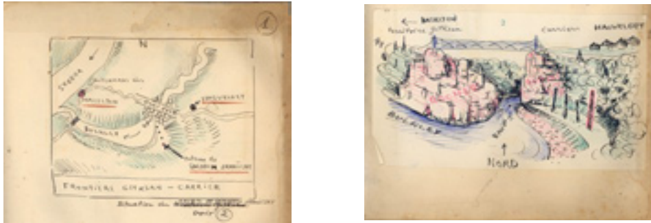
Fig. 4. Kurt, Seligmann Maps , Hagwilget, location of Chieddem Skaniisht pole.

ritually adopted by the clan of the original owner through a symbolic marriage to a deceased woman of this clan. 23