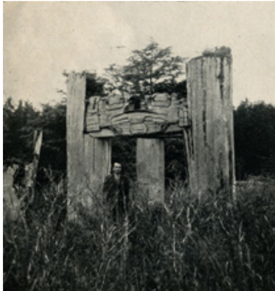
Fig. 10. Eva Sulzer, Wolfgang Paalen at a shaman's grave, Masset, B.C., 1939.

Profiles of people and beasts inextricably intertwined, all dimmed in the evening light, issued from innumerable hatchet blows as precise as a wolf's incisors sinking into its victim, the totem poles stand tall, as if they were lances from a gigantic battle painted by Ucello [...].