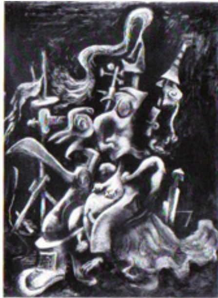
Fig. 1. Kurt Seligmann, Totems I , 1938, india ink with feather brush and color on glass. Dimensions unknown.