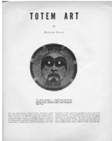
Fig. 7. Wolfgang Paalen, “Totem Art” essay, DYN 4-5 (December 1943).