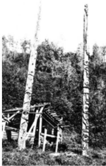
Fig. 8. Kurt Seligmann, Kaiget totem pole, Gédem Skanish [on the right] , British Columbia, 1938. © 2008 Artists Rights Society.

Seligmann and his wife took many field photographs that convey a feeling of sadness – ruins in deserted places with no living soul around; the photographs illustrating his 1939 article show the Kaiget pole standing at the edge of a ravine in an empty village with run-down buildings and collapsing roofs. A picture of Kitwancool renders the same atmosphere: memorial poles, some still standing, several tottering or fallen, in an abandoned village with dilapidated houses. This atmosphere is even more striking in the photograph that shows two isolated poles by a river-bank, as symbols of a long-gone splendor. Seligmann’s photographs have a scientific value as they record the Gitksan-Wetsuwet’en poles’ condition at a certain period of time, but through photographic documentation the photographer intentionally brings out his idea of a dying culture.