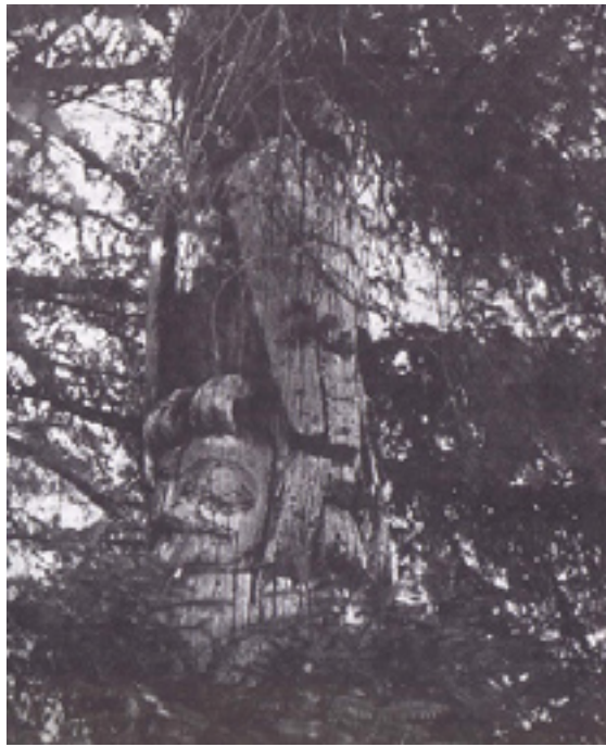
Fig. 11. Eva Sulzer, Haida totem pole in the forest, British Columbia, 1939.

trees and stayed still, like the figure of a carved raven. Paalen recognized in the bird the Northwest mythical figure of the raven which brings light to the world which he compared to Prometheus, the figure of Greek myth, in “Birth of Fire,” another short essay he published in the “Amerindian Number.” 52 Paalen’s perception grew out of his imagination nourished by his knowledge of Northwest Coast mythology and art. That “totemic moment” is a vital experience in which dream and reality are united.