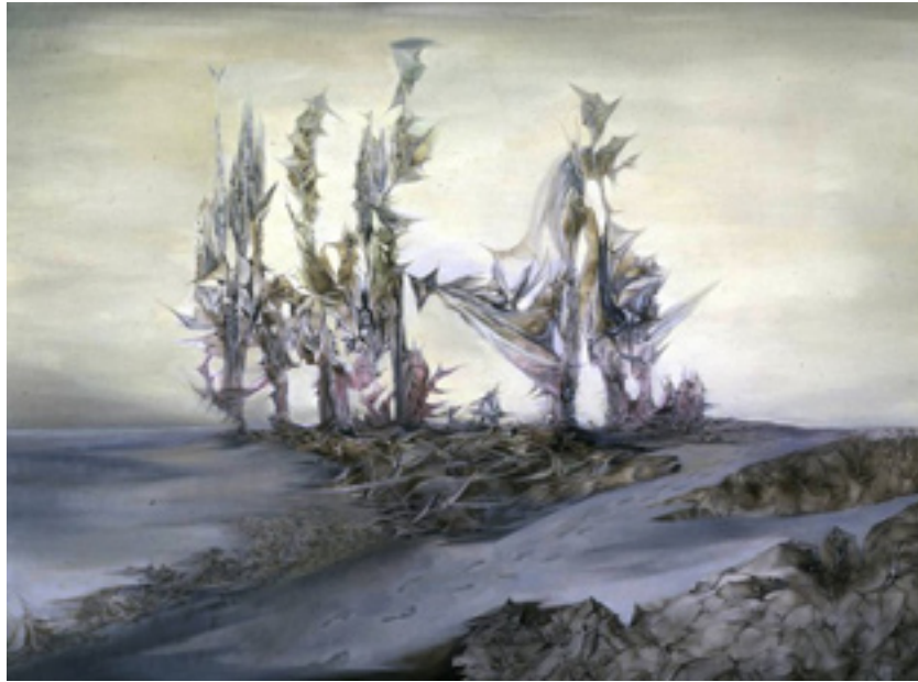
Fig. 9. Wolfgang Paalen, Paysage totémique de mon enfance , oil and fumage on canvas, 1937.

His visionary painted landscapes turned out to be the blueprint of the scenery of British Columbia and Alaska, as described in “Voyage Nord-Ouest” (only recently published) and “Paysage totémique” which appeared in fragments in four issues of DYN . 45 Regler writes that Paalen “[...] was no less surprised when he found with what certainty he had felt the light and atmosphere of the country around Sitka in his “Fata Alaska [painting],” before actually seeing it.” 46 The landscape he discovers on his journey shapes up as the literal transposition of his preconceived vision. In “Voyage Nord-Ouest,” he remarks: