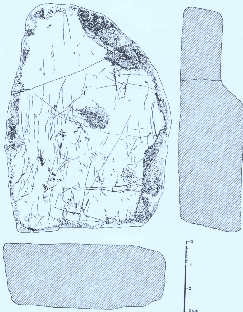
Figure 2. Sandstone Plaquette . Rendering of traces of impact and scraping visible on the upper surface. Longitudinal and transverse profiles of the plaquette are also illustrated. Drawing by S.A. de Beaune.