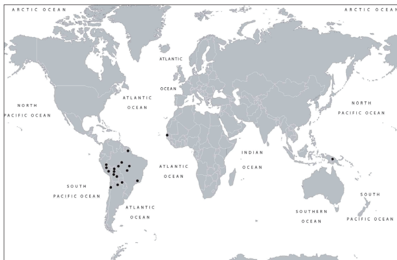
Geographic distribution of specific sociative causative markers

By contrast, we found very few examples of specific sociative causative markers in other parts of the world, even in Meso- and North America. As a matter of fact, we only found these types of markers in Wolof (Atlantic family, Senegal) and Alambak (East Sepik, Papua). This particular distribution of specific