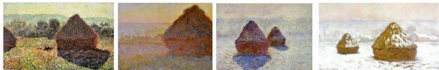
Figure 2. Les meules (Monet, 1890-1891), visual evocation of spring, summer, autumn and winter

Let's consider some audio-visual representations for temperature and wind. Various light and color effects may evoke a season and consequently give an indication of global temperature (figures 2 and 3). Post-processing methods may be used to modify saturation or value of colors. Moreover, we can draw our inspiration from cartoons studios and propose colors palette corresponding to seasonal light ambiances. In addition, we can use the depth of field which varies according to heat.