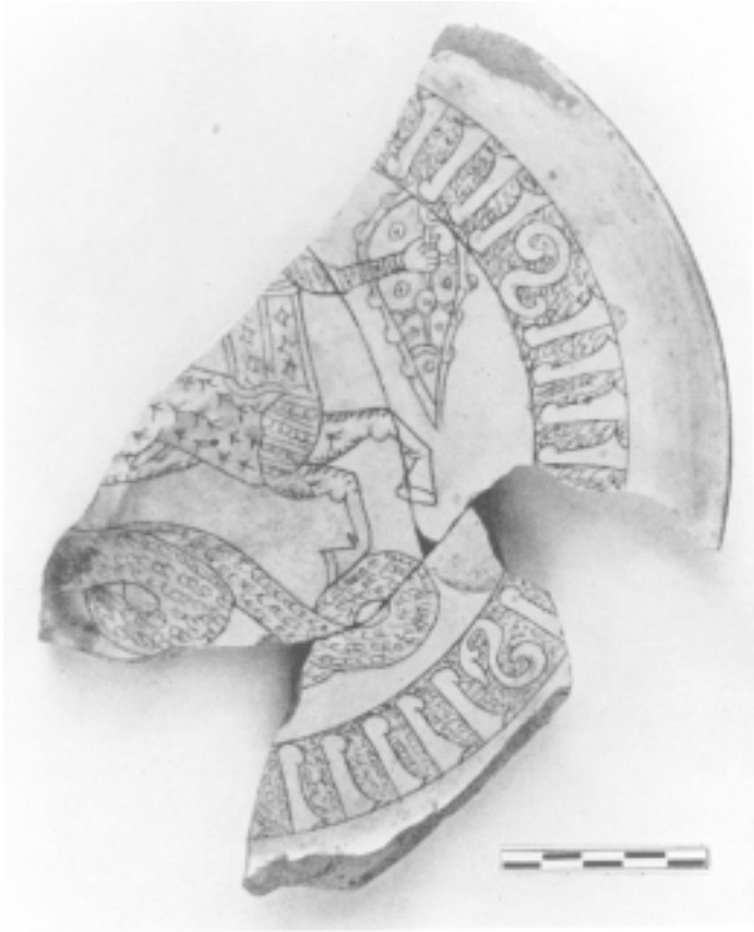
3. Corinth, Fine Sgraffito plate (after C. H. Morgan, The Byzantine Pottery . [Cambridge, Mass., 1942], 118, fig. 92, no. 969)