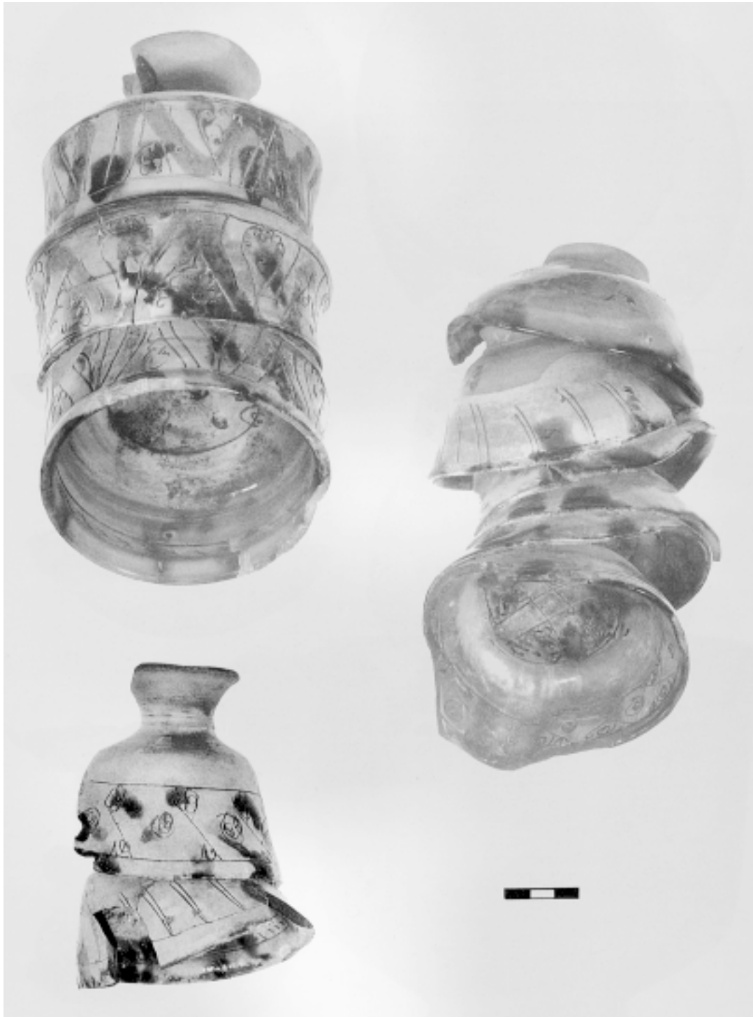
7. Vases deformed by excessive heat in the furnace (after D. Papanikola-Bakirtzi, Μεσαιωνική Εφυσλωμένη Κεραμική της Κύπρου [Thessalonike, 1996], pl. xxx)