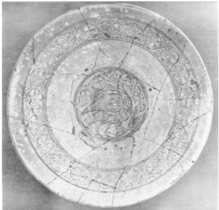
4. Corinth, Fine Sgraffito plate (after Morgan, Byzantine Pottery , 119, fig. 93, no. 965)