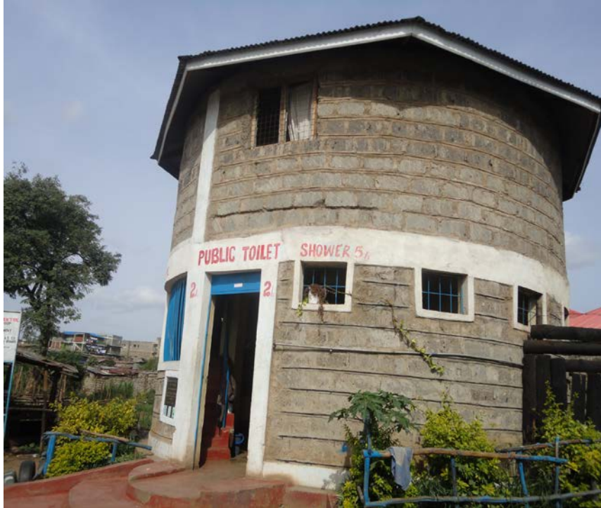
Figure 1: Tegemeo Bio-centre, Korogocho Market