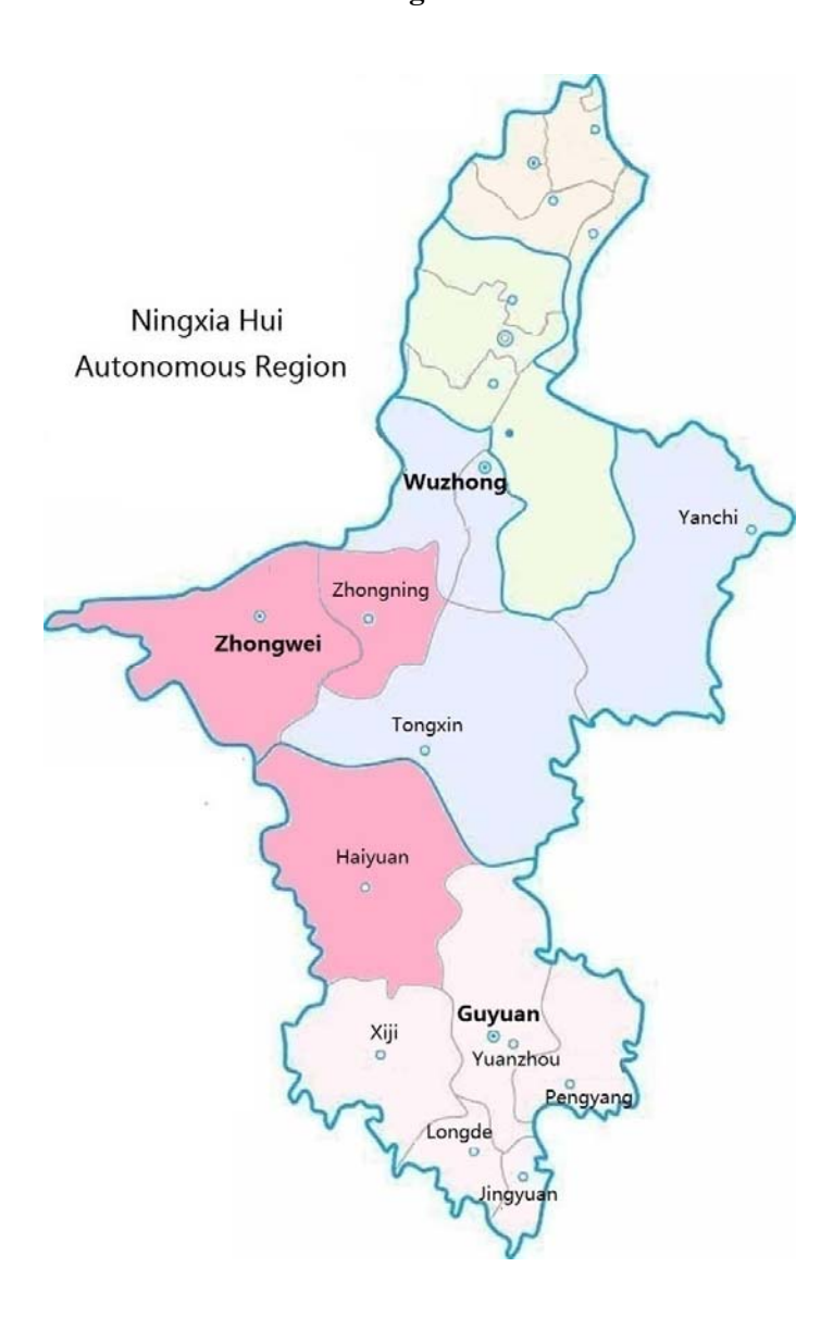
Figure 1 – Map of the surveyed prefecture-level cities and counties in Ningxia Hui Autonomous Region