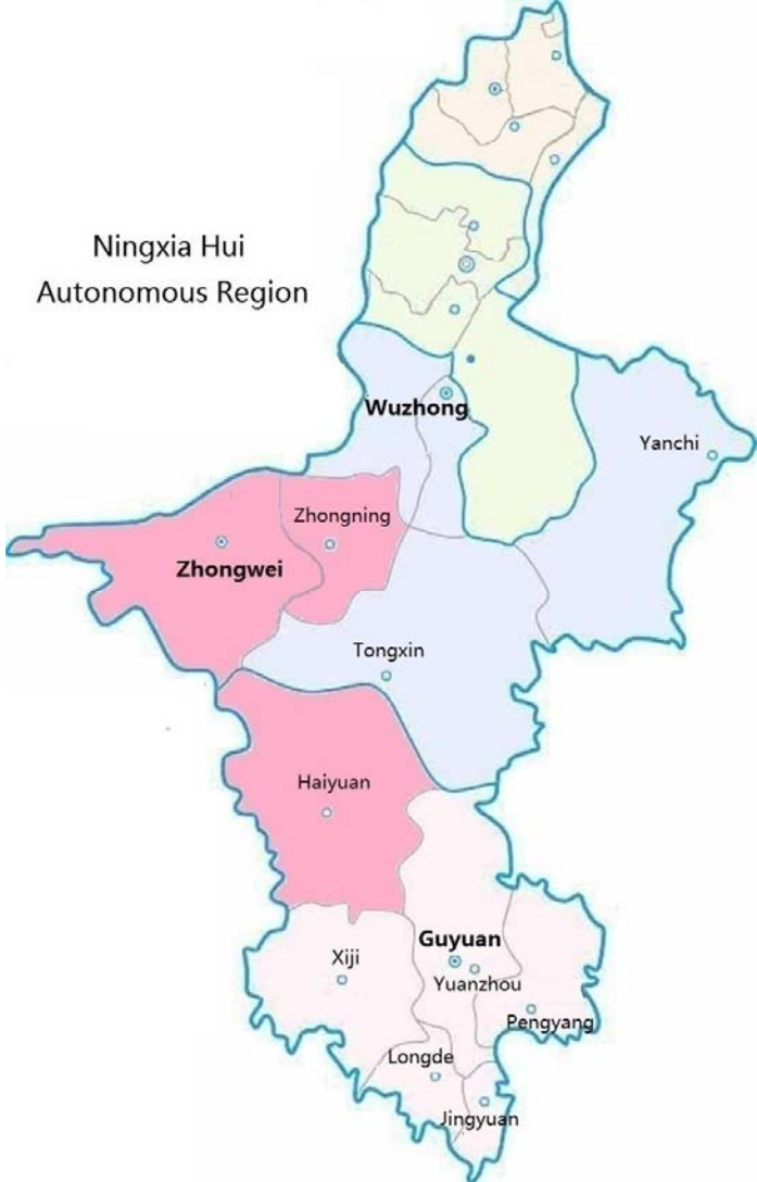
Figure 1 – Map of the surveyed prefecture-level cities and counties in Ningxia Hui Autonomous Region