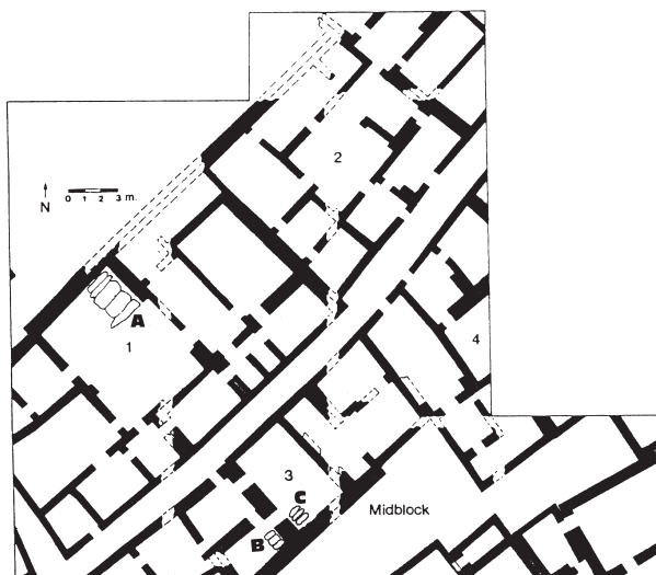
Fig. 2 : Map of a section of the Outer Town of the Late Early Bronze Age settlement of Tiriş Höyük highlighting three intramural tombs (A B95.60, B B94.55, and C B95.58).