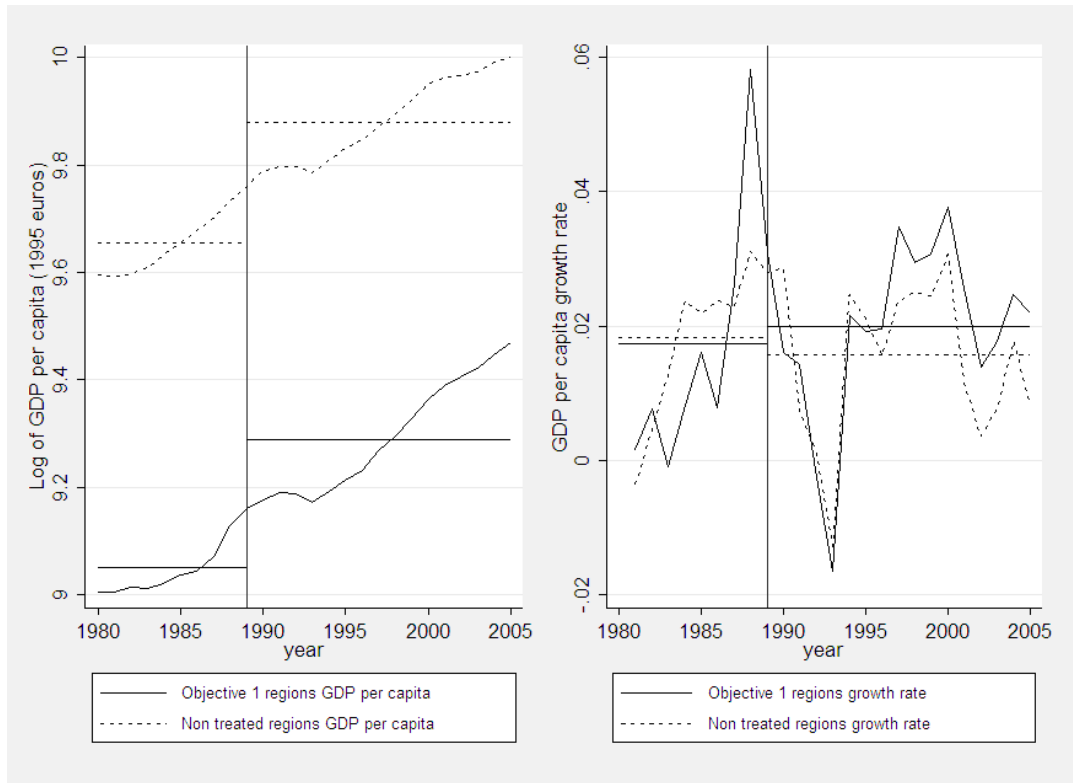
FIG. 1: Annual versus Before/After intervention income and growth by treatment status (authors' calculation, Cambridge Econometrics database)