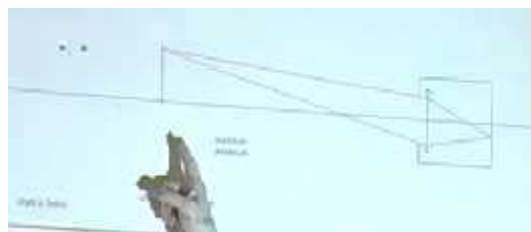
Figure 3: dynamic representation of an eye, from a physics point of view (representation obtained by Cabri software; case of an object at a finite distance from the eye).

Through his gestures when projecting the Cabri figure, the teacher has provided links between two semiotic registers: the schematic register and the register of natural language. In fact, the teacher pointed with his finger relevant elements on the representation; for the converging lens for example he said: "light rays as they pass through the lens as they are all converging lens ...." (figures 2 and 3).