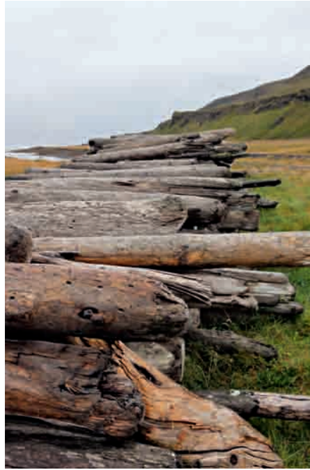
5-6. Piles of driftwood thrown up on the shore of Húnaflói Bay, between Hvammstangi and Hólmavík.

being said, for it is probable that Iceland has never known real forest coverage. At the most, there will have been woods, but however many trees they contained they will not have grown above average height, probably because of the winds that lash the island throughout the year» 4 . Returning in part to this point in his overview of L'Islande médiévale , published in 2001, the great historian continues to be doubtful or at least wary: «It is not impossible that the country once had extensive woods, as legends recount and as the ancient texts affirm, but close reading of them reveals clear echoes of the Bible and the discovery of the Land of Canaan, and the wind, which prevails over everything in those parts, cannot have helped the growth of large woods» 5 .