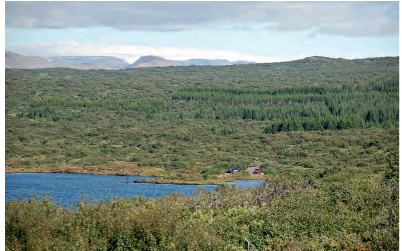
8. Wooded area of Þingvellir National Park, around Lake Þingvallavatn, September 2012.

XX century alone 18 . And the consequences affect not only the soil, the water cycle, biodiversity and greenhouse gas emission, but also the productivity of economic activities, the quality of life conditions, the transmission of lifestyles, memory and culture. To what point can the “clearing” of human civilization continue to expand? Is not the extreme “insularity” of Iceland, which accentuates the fragility of ecological balance, perhaps a sort of synecdoche for the finiteness of the biosphere? In this case, the image of Skríúður as an oasis in the middle of the desert becomes immensely significant. The Reverend Sigtryggur Guðlaugsson’s achievement takes its place on the horizon of hope, of which Jean Giono’s short story L’Homme qui plantait des arbres (1953) – the tale of a simple shepherd who set out to reforest his region of Haute Provence –