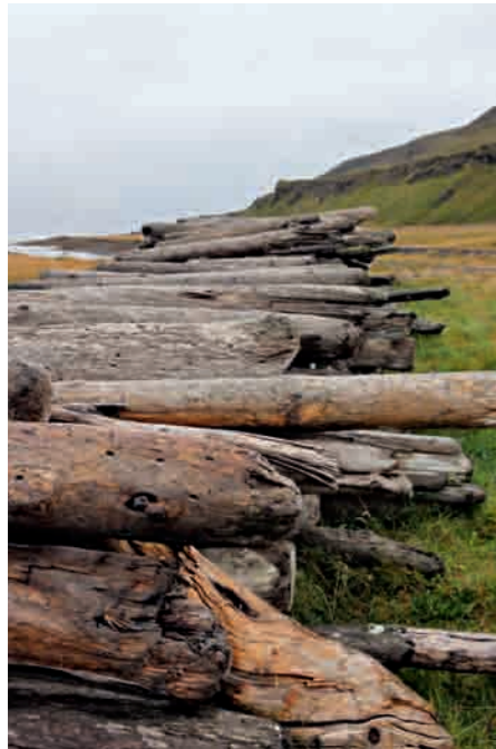
5-6. Piles of driftwood thrown up on the shore of Húnaflói Bay, between Hvammstangi and Hólmavík.

being said, for it is probable that Iceland has never known real forest coverage. At the most, there will have been woods, but however many trees they contained they will not have grown above average height, probably because of the winds that lash the island throughout the year» 4 . Returning in part to this point in his overview of L'Islande médiévale , published in 2001, the great historian continues to be doubtful or at least wary: «It is not impossible that the country once had extensive woods, as legends recount and as the ancient texts affirm, but close reading of them reveals clear echoes of the Bible and the discovery of the Land of Canaan, and the wind, which prevails over everything in those parts, cannot have helped the growth of large woods» 5 .