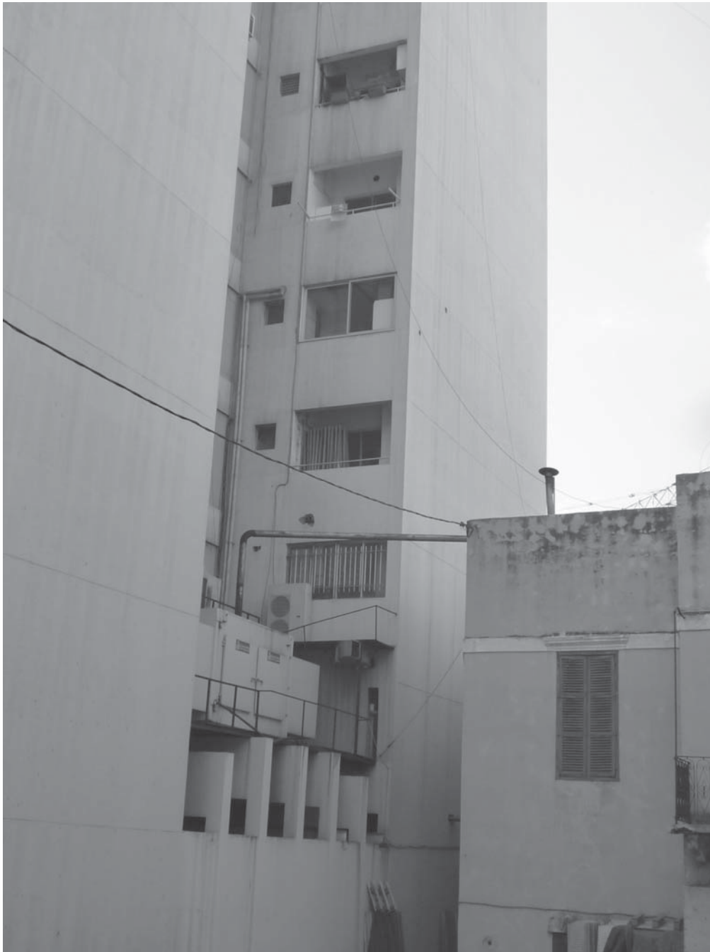
Figure 8.4 A generator serving a middle class building in Beirut, 2014